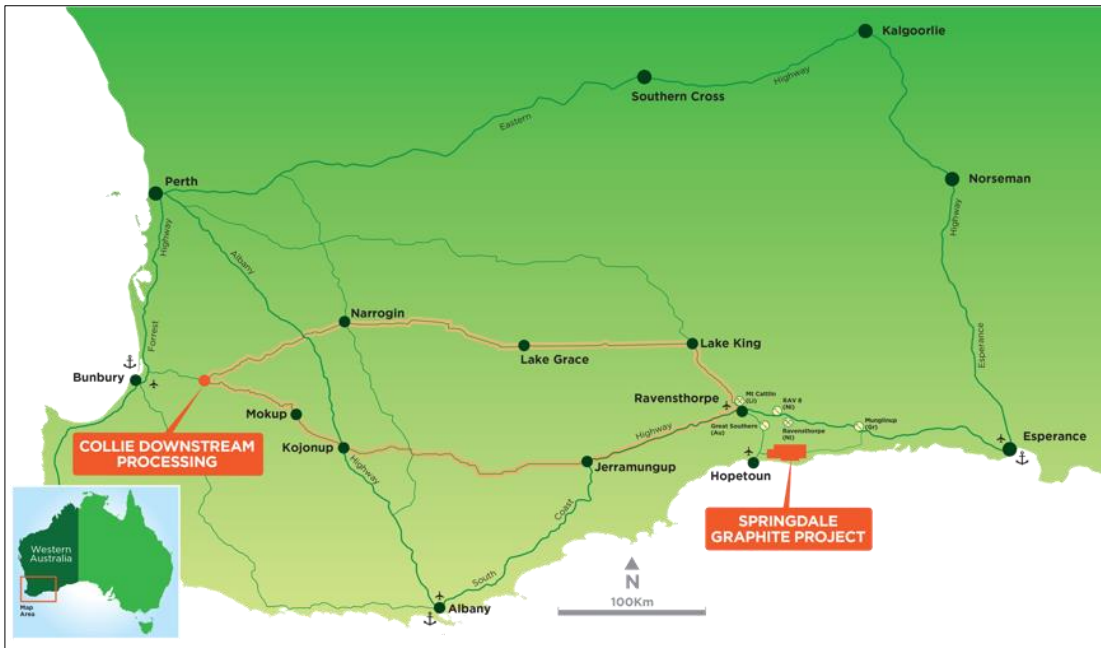
Figure 3: International Graphite project locations

The Company is in the early phases of development, spending $5.2m on exploration & evaluation at Springdale and $1.6m on midstream process development, including $759,000 on graphite processing equipment. The Company reported an operating loss for the 2022-23 financial year of $2,533,229 (2022: $2,055,940) after providing for income tax.