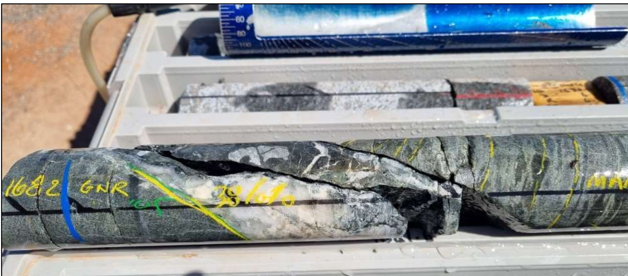
Photo 3: Faulted contact between the OIC and gneissic country rock from OCD004 from 1,682m