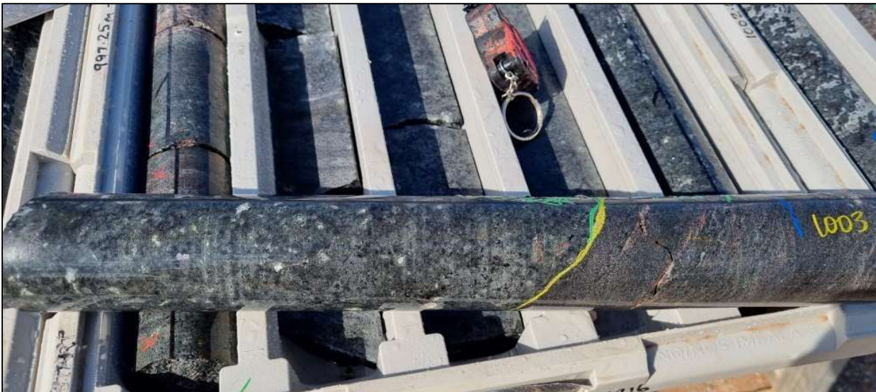
Photo 2: Carbonate contaminated orthopyroxenite and garnet-rich pelite contact from OCDD002 from 1,003m.

A detailed structural logging campaign is nearing completion on the four completed diamond drillholes at Octagonal (see Figure 1 and Photos 2 and 3). Structural expert Jon Standing from Model Earth Pty Ltd has completed the data acquisition phase of the structural review. The data gathered from the recently completed diamond drillholes will give new lithological and structural context, critical to the understanding of the Octagonal Intrusive Complex (OIC). Coupled with new HPFLTEM data and refined seismic interpretations post-acquisition of the downhole petrophysical property data, these new datasets add to the existing foundation data to evolve the targeting model across the OIC.