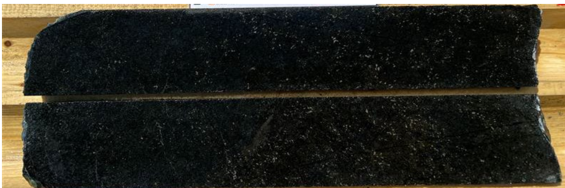
Figure 1: DDED23-131 interstitial to disseminated sulphide mineralisation