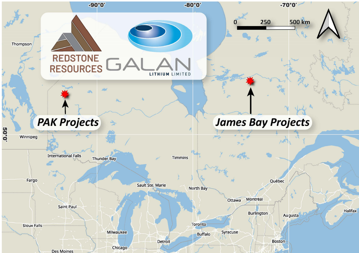
Figure 1: Location of the Projects the subject of the JV between Redstone Resources and Galan Lithium Limited. The PAK Lithium Projects are located in Northwest Ontario and while the Taiga-Hellcat-Camaro lithium projects are located in James Bay, Quebec, Canada