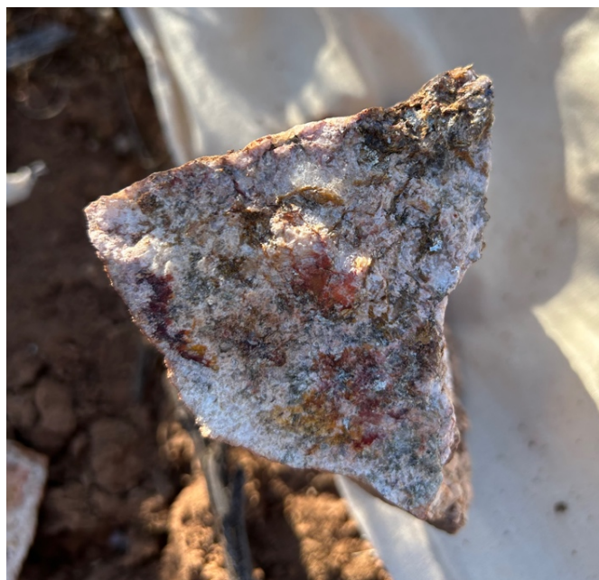
Reference: 1 – close up