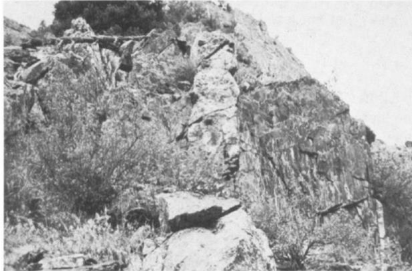
Image 1: View to the north of the western albite-quartz-spodumene pegmatite. Sharp contacts with schist are apparent. (Jacobsen, M.I. 1985)

The Kings Canyon Pegmatites are defined by 3 vertically dipping, subparallel veins that outcrop for ~100m along strike (Jacobsen 1985). At surface, the pegmatite veins are up to 1.5m thick with quartz-albite-spodumene- amblygonite mineral assemblages. Spodumene-bearing pegmatites have also been noted at the Debbie Doll, Buckhorn, Big Boulder and Hyatt pegmatites (Thurston 1955). While lithium pegmatites are rare in Colorado, the Kings Canyon, and surrounding, pegmatites are unusual in that they represent the unzoned type of spodumene pegmatites that contain anhedral, phenocrystic spodumene (Jacobsen 1985). The Kings Canyon pegmatites are interpreted to be the same age and mineralogically resemble the pegmatites in the southern Black Hills of South Dakota.