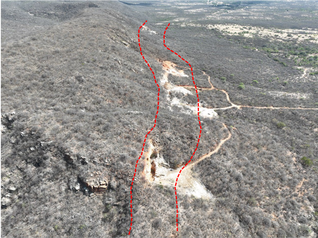
Figure 3: Drone image looking south to north along the strike of the outcropping and previously mined pegmatite bodies at Mina Vermelha, with a circa 2km corridor outlined in red.