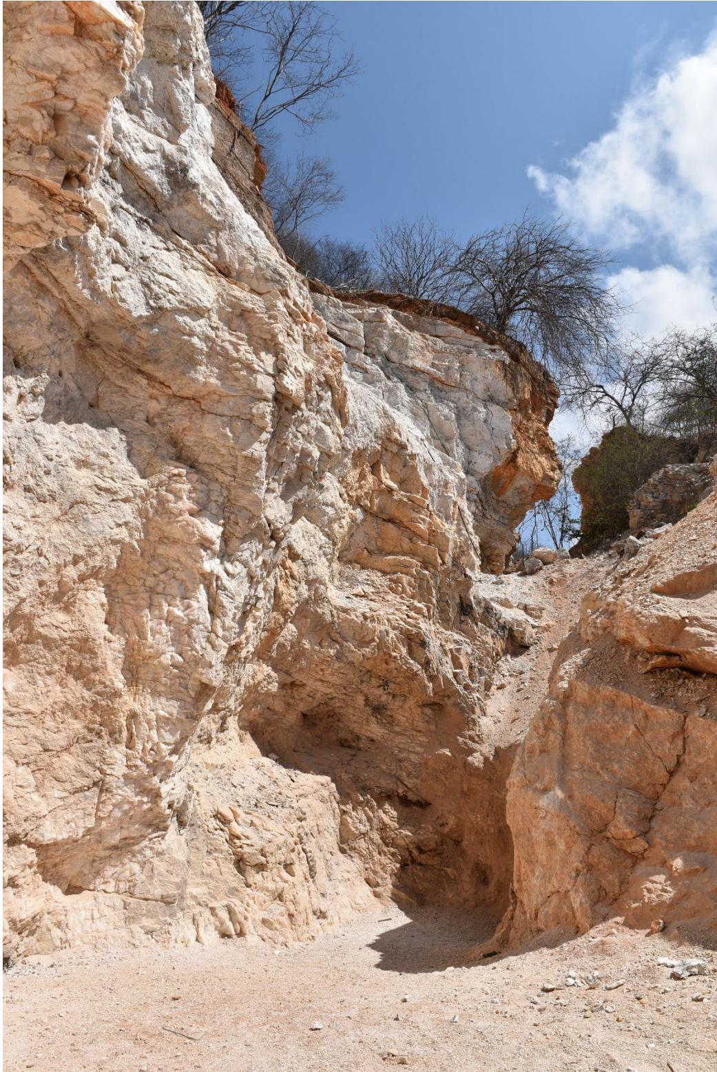
Figure 4: Large outcropping pegmatites in artisanal working up to 25m in thickness with visible Pollucite and Spodumene. Grab samples OM0035 and OM0037 (see Table 1 and Figure 1) were sampled from this artisanal working at Mina Vermelha.