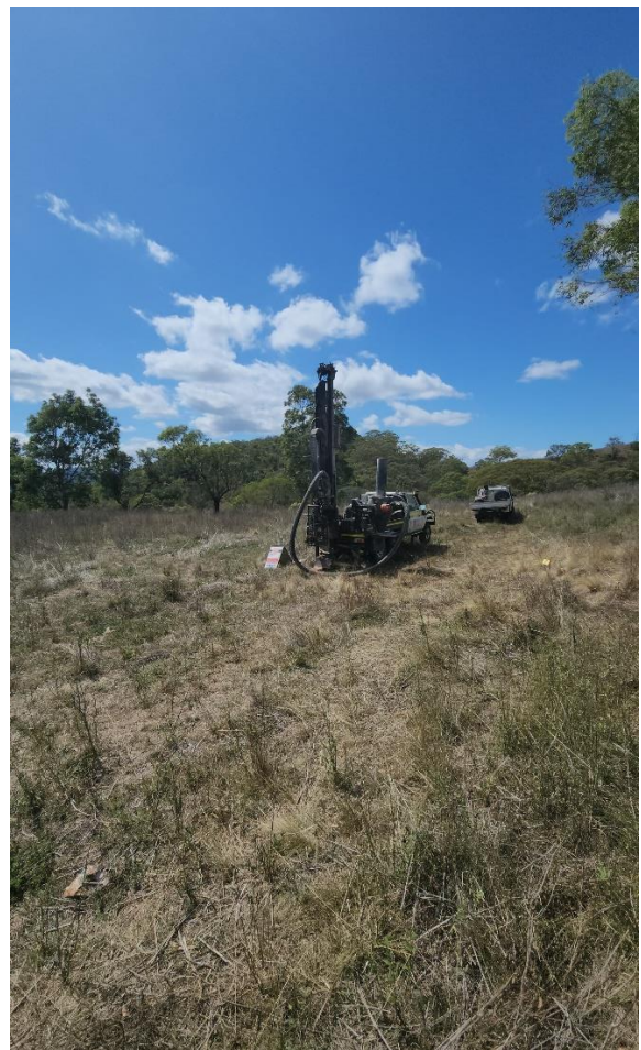
Figure 4: Management site visit to the Smoky Project drill program March 2023