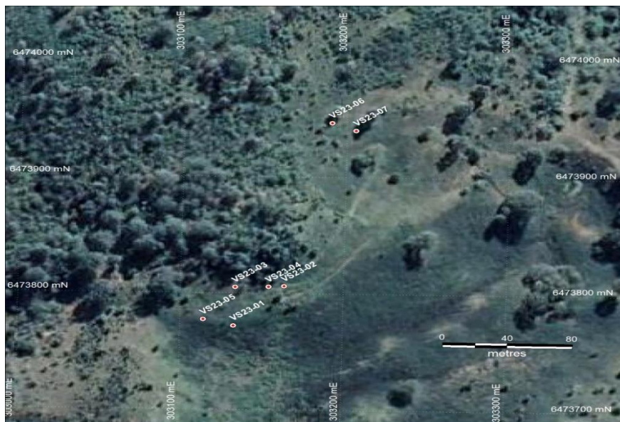
Figure 1: Drillhole locations at Smoky Project Site

The work programs completed in March and April 2023 on the Smoky Project have been a beneficial step for Viridis. The team remains committed and working diligently across our projects to continue generating value for shareholders.”