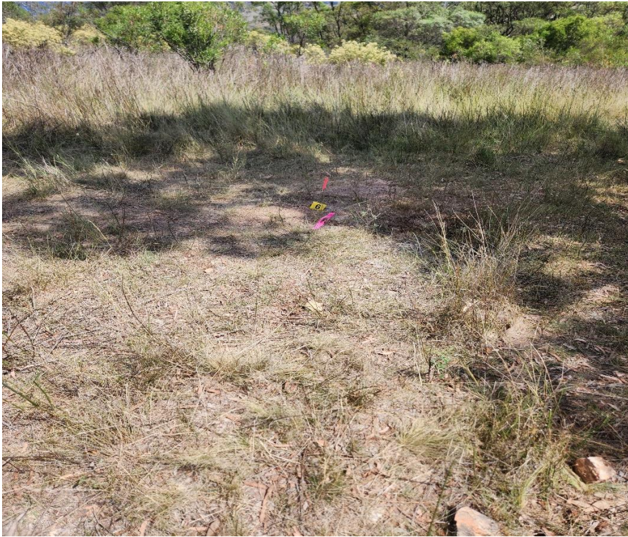
Figure 3: Smoky Project drill site VS23-06 post drilling