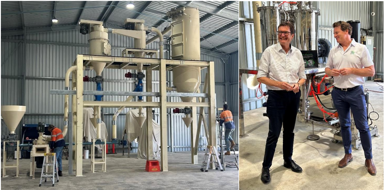
Figure 1 (left): Qualification plant installation at International Graphite's R&D facility, in Collie, Western Australia