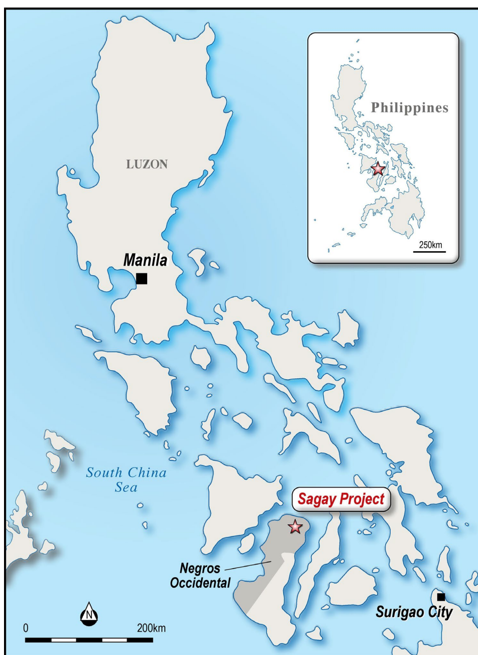
Figure 3. Location of the Sagay Project in the island of Negros, Philippines.

A Maiden Mineral Resource for Nabiga-a Hill was declared for the project on 7 November 2022 comprising 302 million tonnes @ 0.41% copper and 0.11g/t gold for 1.2 million tonnes of contained copper and 1 million ounces of contained gold, of which 15 million tonnes @ 0.45% copper and 0.11g/t gold is classified as Indicated and 287 million tonnes @ 0.41% copper and 0.11g/t gold is classified as Inferred.