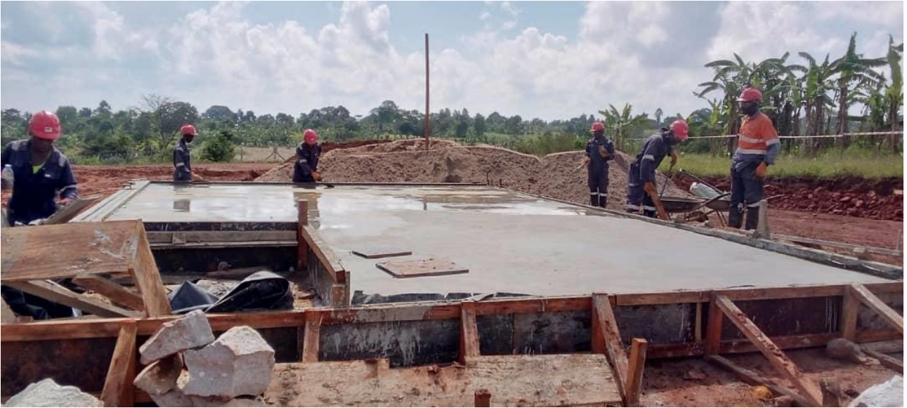
Figure 10: Agglomerator pad concrete slab poured and curing.