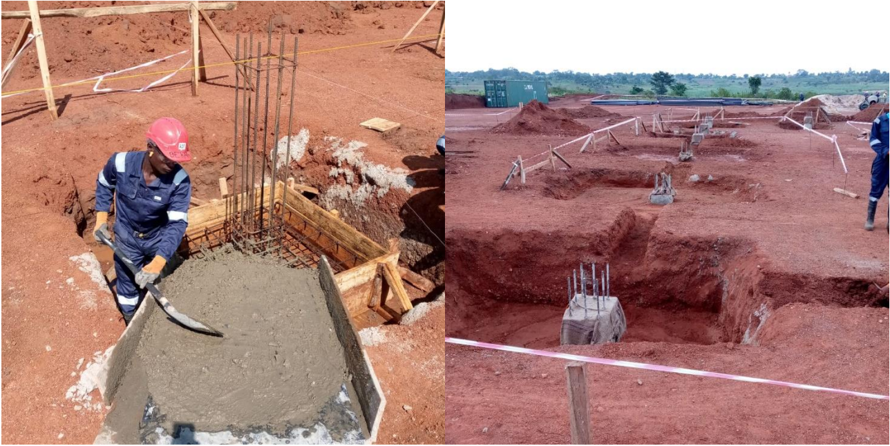
Figure 6: Casting of ground bases, on left, and excavations for the ground beam on right.