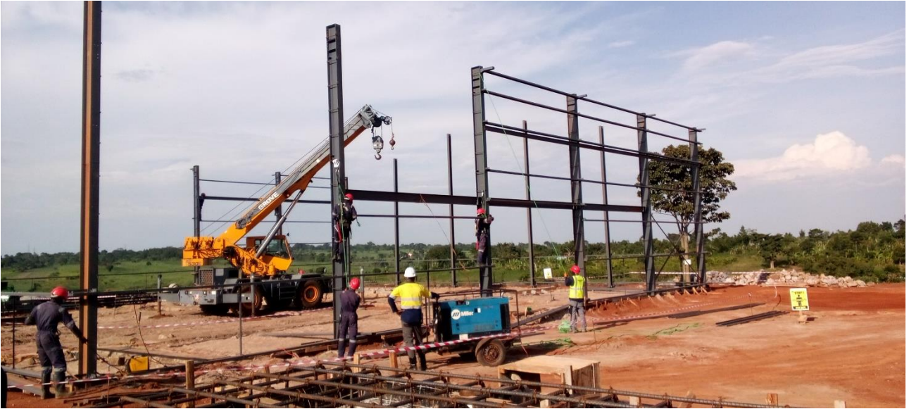
Figure 8: Erection of the Technical Facility steel column structure.