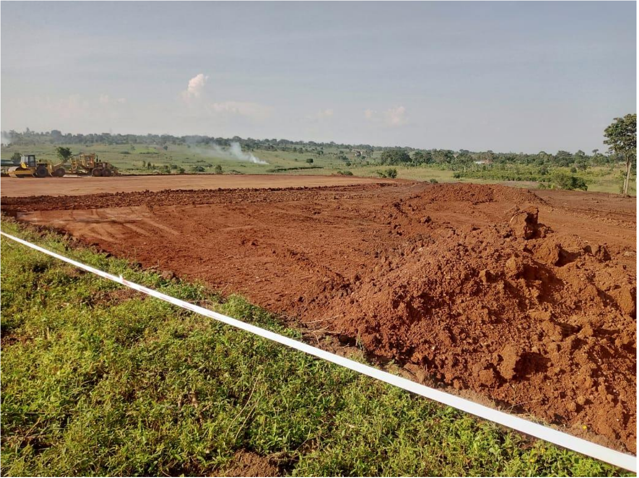
Figure 4: Removal of the topsoil layer across the Demonstration Plant facility area.