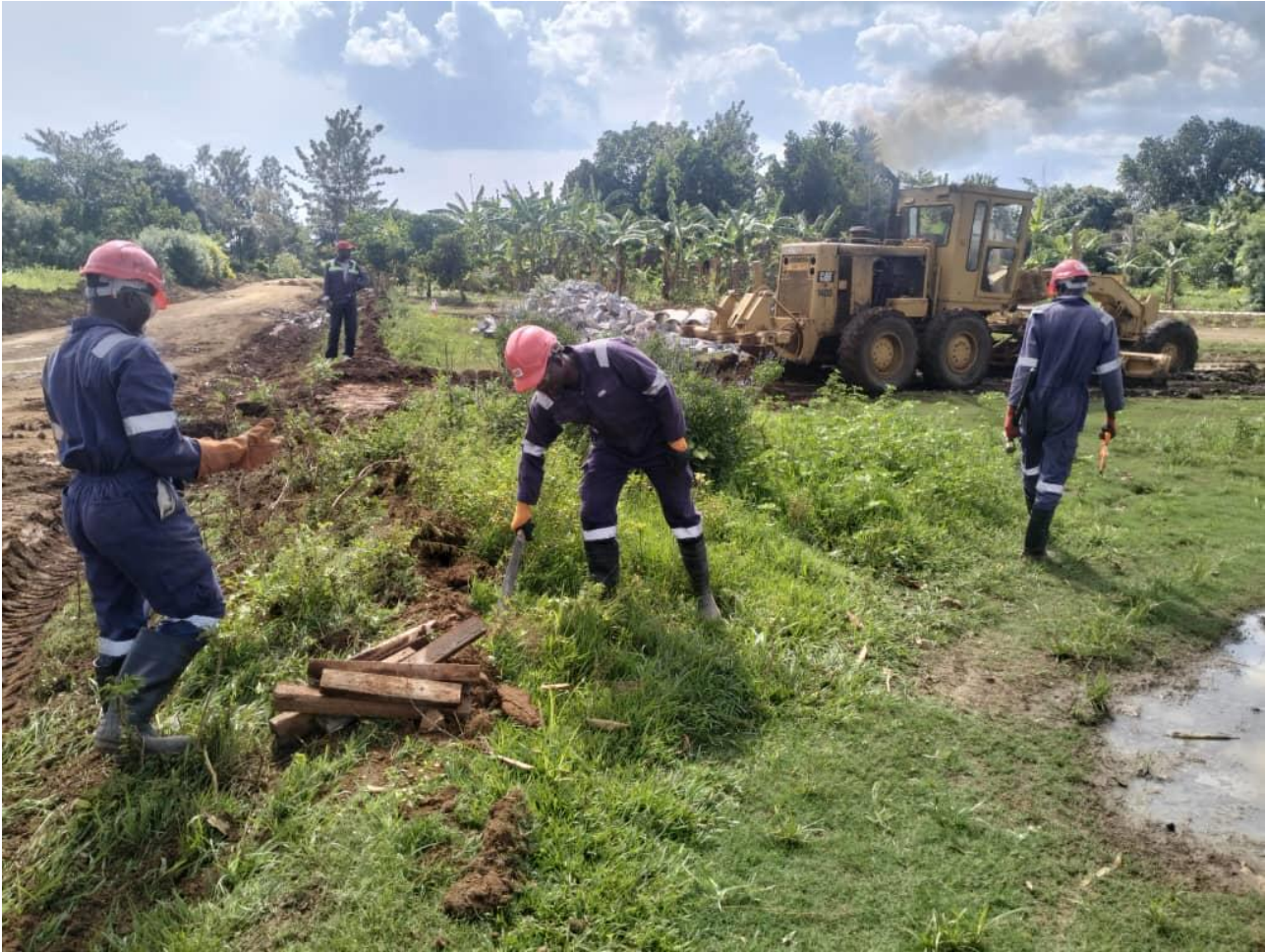
Figure 14: Makuutu Demonstration Plant and Technical Facility access road in construction.