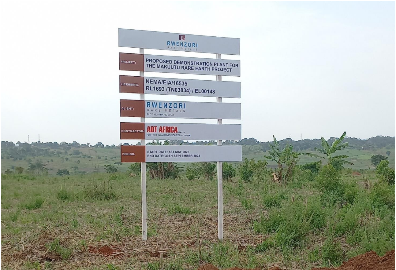
Figure 2: Makuutu Demonstration Plant site entrance.