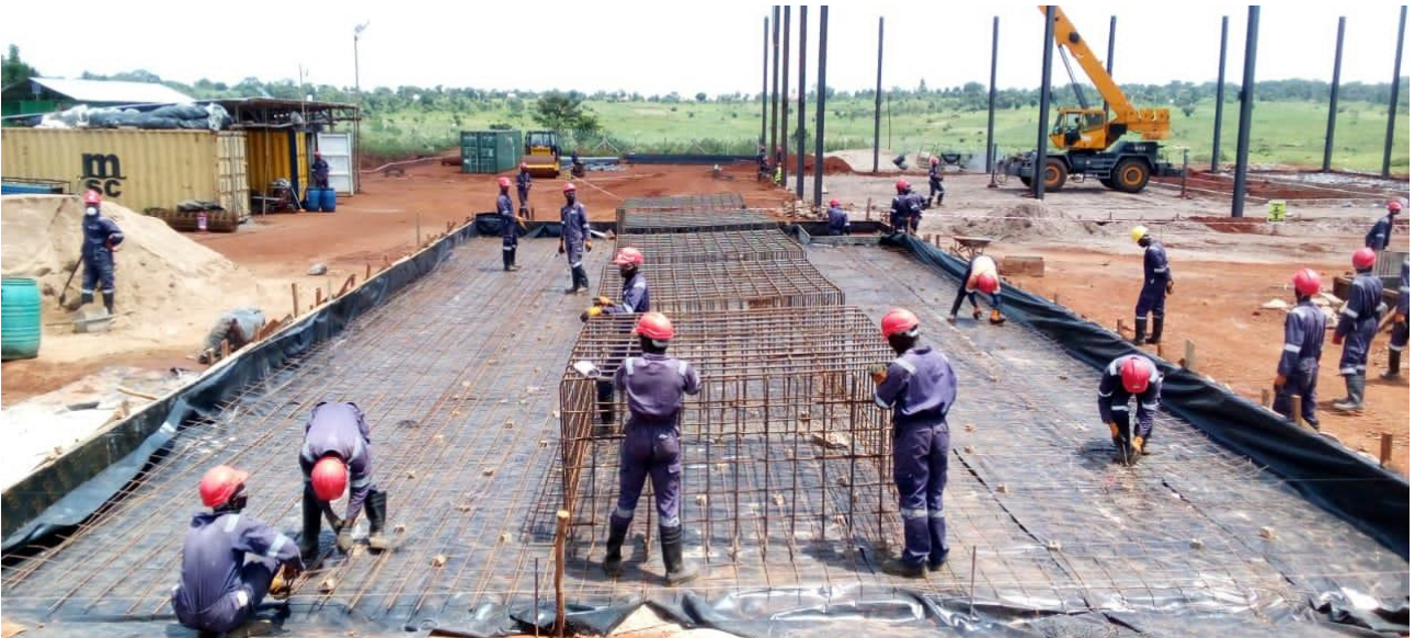
Figure 11: Heap desorption crib foundations prior to concrete pour.