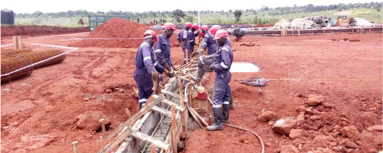
Figure 7: Casting of the Technical Facility ground beam.