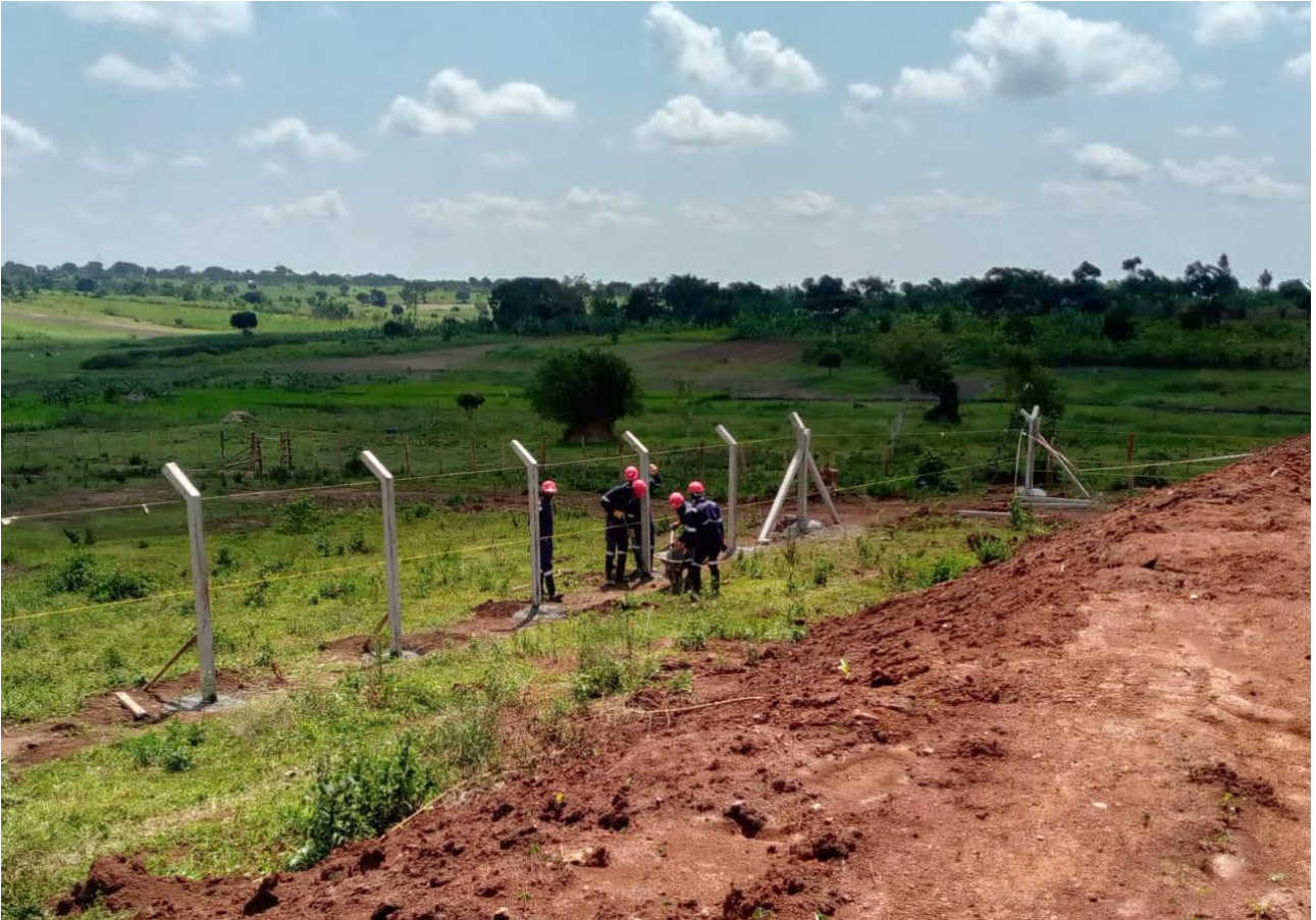
Figure 12: Installing boundary fence posts.