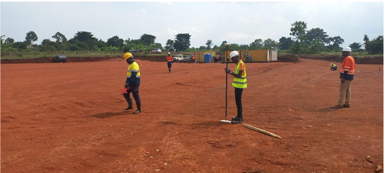
Figure 5: Marking out the Demonstration Plant footworks.