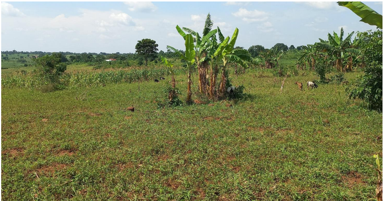
Figure 3: Makuutu Demonstration site prior to works commencing, April 2023.