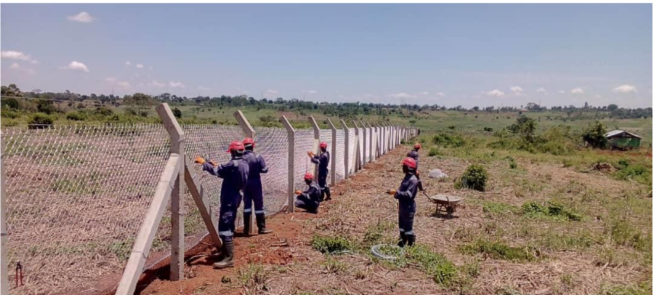
Figure 13: Boundary fence installation.