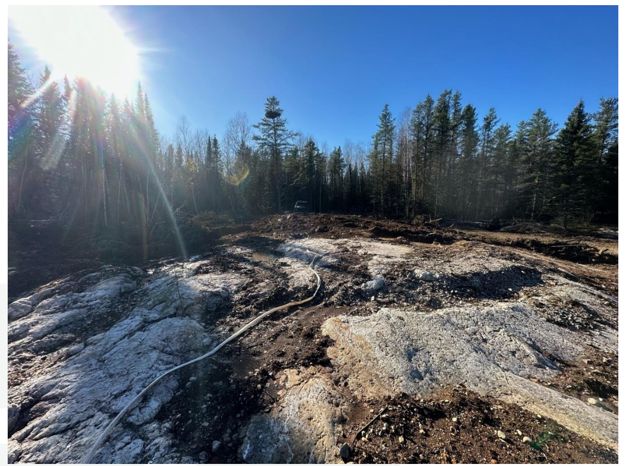
Figure 2: Additional drill pads being prepared at Koshman.