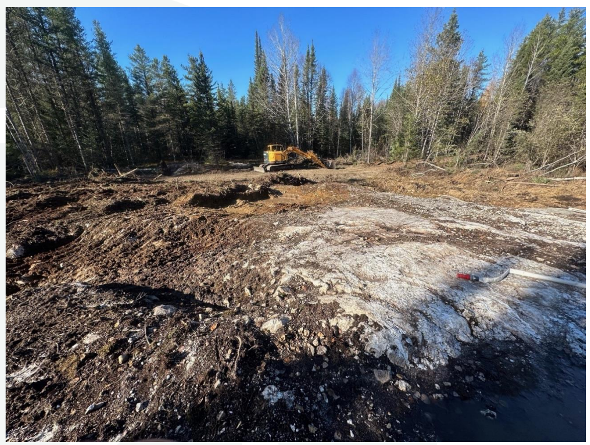
Figure 1: Stripping and washing ongoing at Koshman.

If the current drilling campaign continues to yield encouraging results, the Company is assessing options and preparing the site to allow for year-round drilling activity.