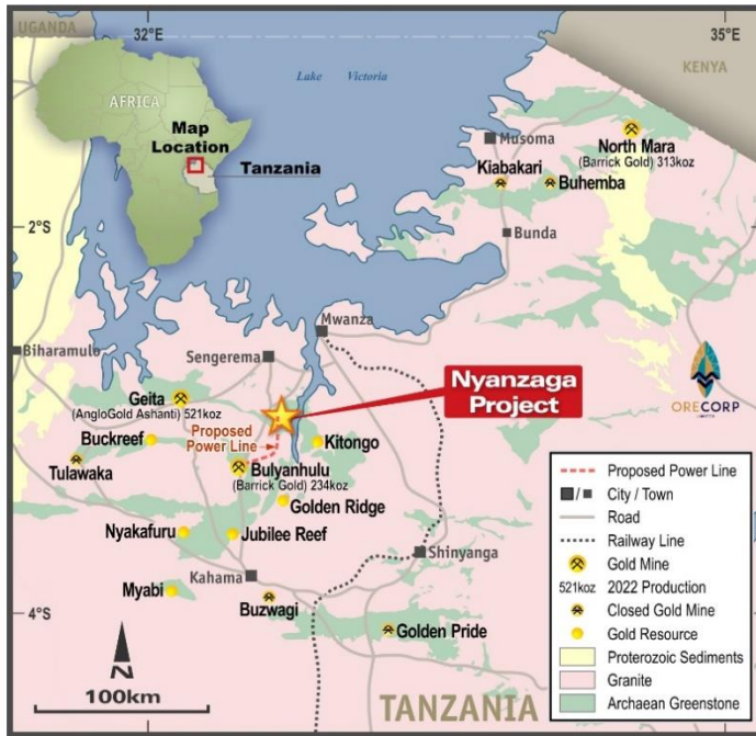
Figure 1: Lake Victoria Goldfields, Tanzania