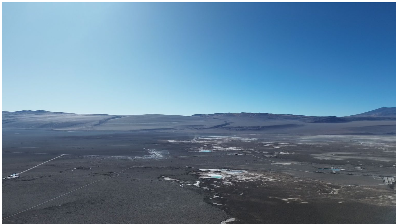
Figure 2 – Neighbouring drill programme adjacent to the Maria Magdalena tenement. Footage from the SRK site visit in August 2023

We believe that this will be outlined by the upcoming drilling programme planned for late 2023.”