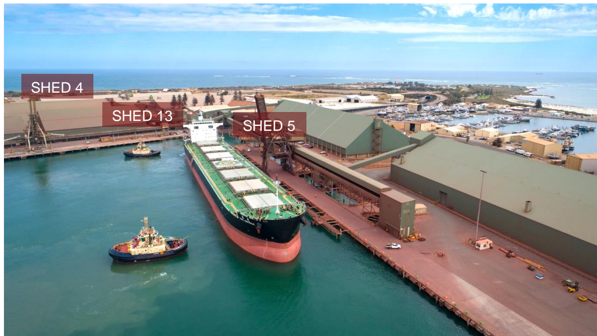
Fenix's on-wharf Geraldton Port storage facilities

During the September Quarter, Fenix Port Services loaded a total of 196,176 wmt of product on behalf of a third-party customer. These arrangements were subject to a short-term transitional contract inherited from Mount Gibson as part of the acquisition of their Mid-West assets. The contract had a term of three months ending on 30 September 2023. Fenix is negotiating a longer term contract and will update the market once this arrangement is confirmed.