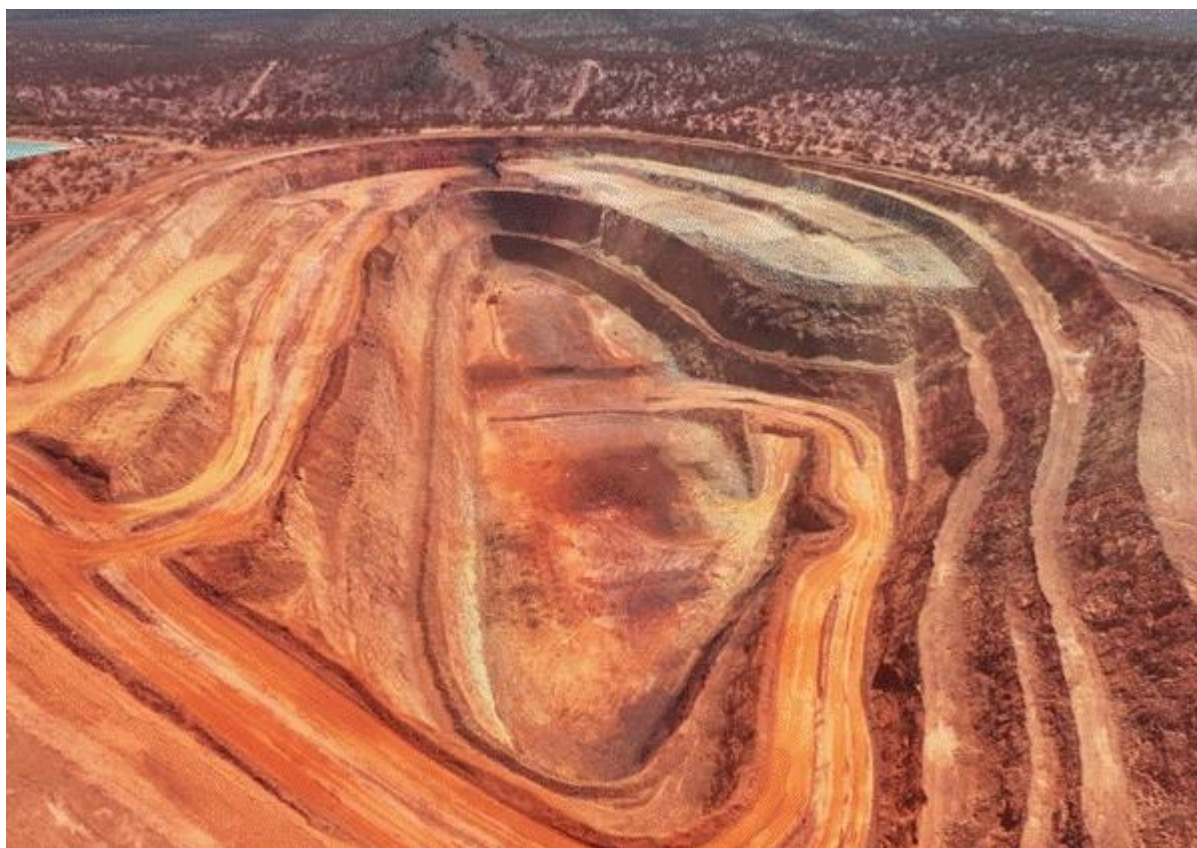
Fenix's 100% owned Iron Ridge Iron Ore Mine – October 2023

The Iron Ridge C1 operating margin, not including hedging and quotation period adjustments, for the September Quarter was ~A$70/dmt. The C1 operating margin is calculated as the Average Realised FOB price less C1 Cash Costs, calculated on an equivalent dry metric ton basis for the period.