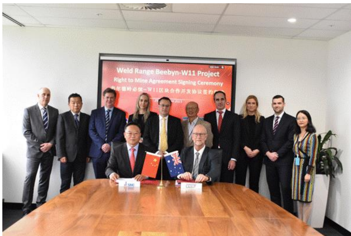
Sinosteel and Fenix signing ceremony for the 10 million tonne Right to Mine Agreement over Beebyn-W11