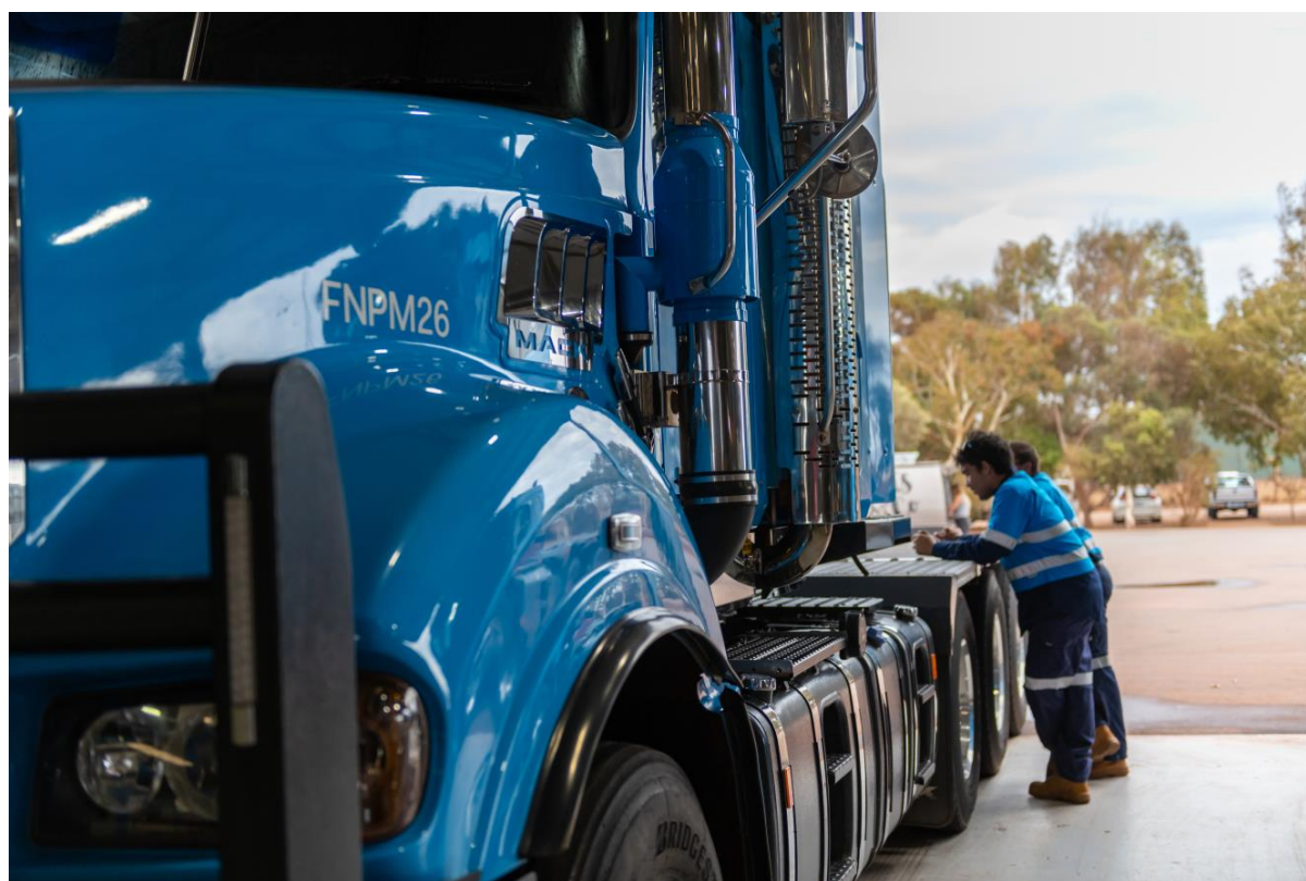
Fenix-Newhaul Geraldton truck workshop

As at 30 September 2023 the asset value of Fenix-Newhaul's haulage fleet and associated infrastructure was ~A$34 million, offset by debt obligations totalling ~A$22 million.