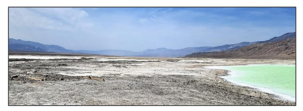
Figure 4: View of the Salt Fire Flat at Liberty Lithium