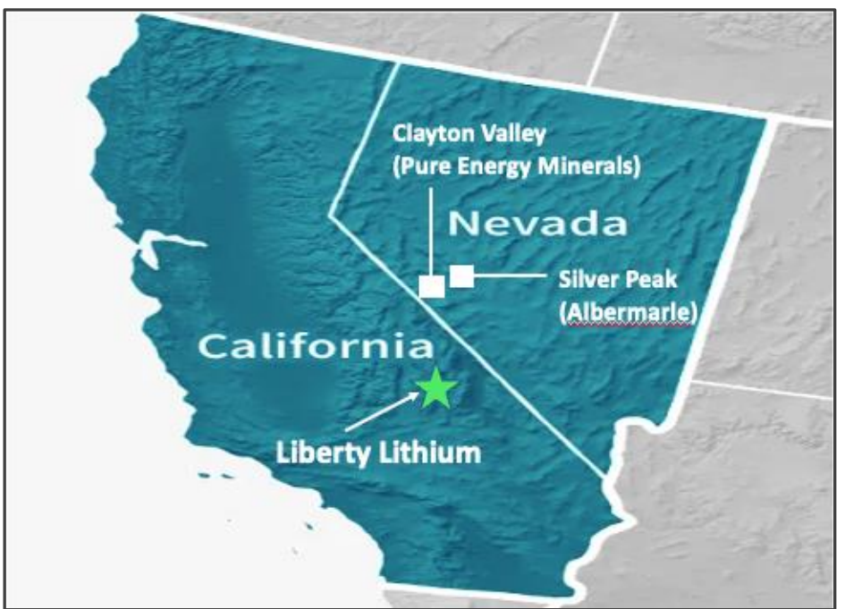
Figure 1: Location map of Liberty Lithium area (SaltFire Flat Project)