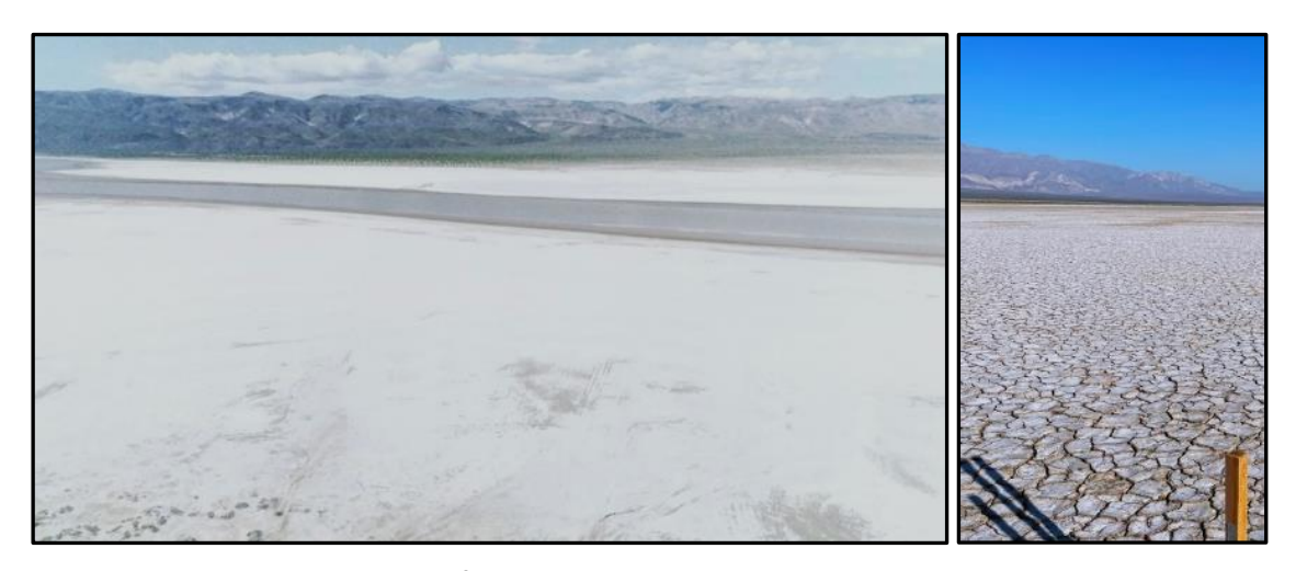
Figure 5: The first drill site-Salt Fire Flat at Liberty Lithium