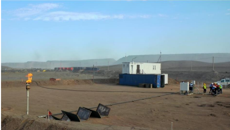
Continuous flare at Lucky Fox-2

Initial gas break through was reported on 25 July 2023, with continuous flaring of gas across all three wells commencing on 9 August 2023.