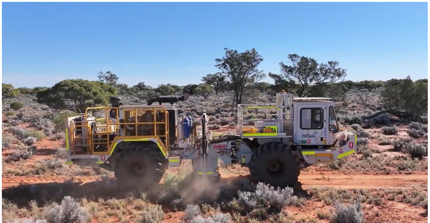
Fig. 8 – Tarcoola August 2023 Seismic Program in Action (click image above or here to play)

Copies of the Company's presentations and other media, including interviews and video recordings of conference presentations, are available on the 'Investor' section of Company's website: