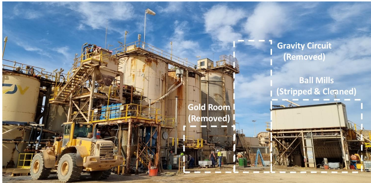
Fig. 6 – Central Gawler Mill with gravity circuit, gold room and other key equipment removed 7

During the quarter two further parcels of gold bearing concentrates were produced. Total saleable gold concentrates on hand are now ~11 dry tonnes grading ~3,880 g/t Au, for a contained metal value of ~1,400oz Au (~AUD $4.25m contained value assuming AUD gold prices of $3,050/oz). 8