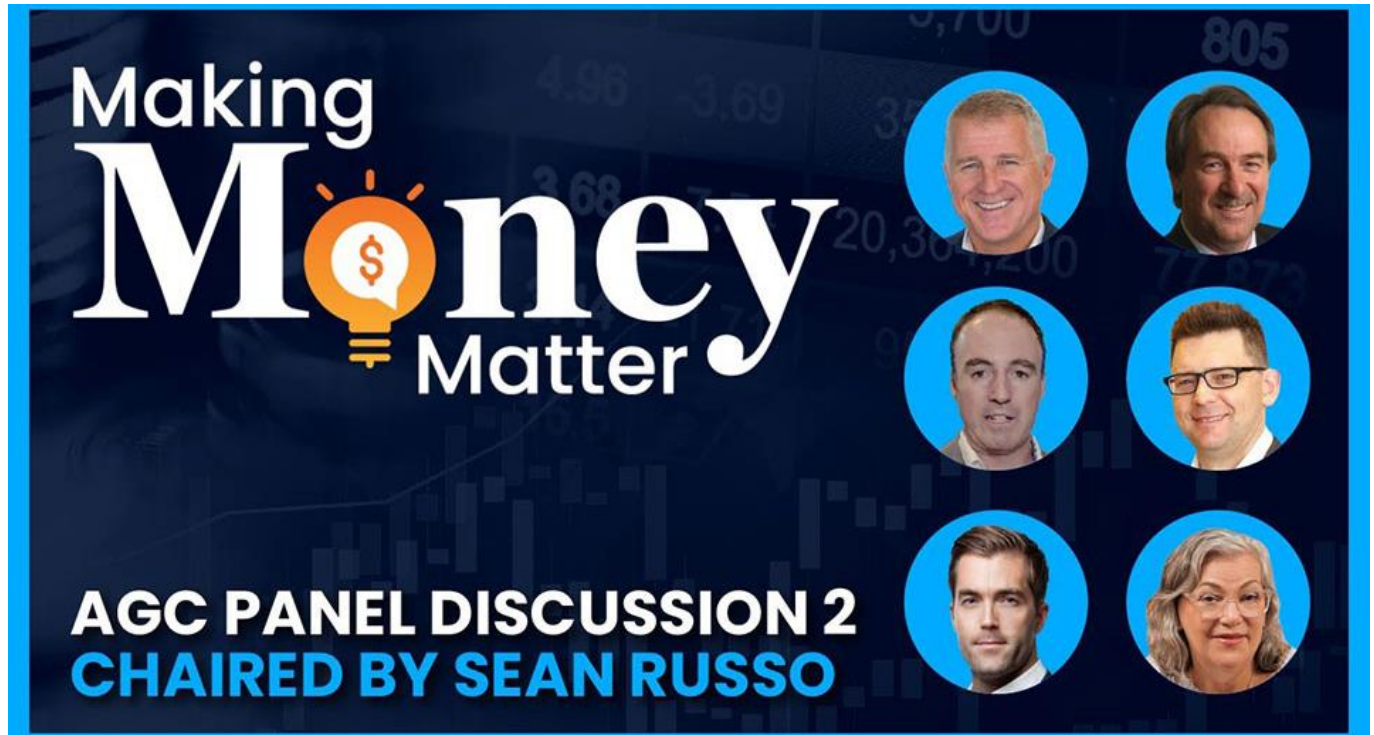
Fig. 7 – 2023 Australian Gold Conference Closing Panel Discussion ( video link )

During the quarter Barton presented to investors on 19 July at the Noosa Mining Conference , on 30 August at the Australian Gold Conference , on 13 September at the Beaver Creek Precious Metals Conference , and in various media interviews to discuss the Company's recent Mineral Resources update for Tunkillia's 223 Deposit and its large-scale follow-up work plans (currently underway) targeting further Resources growth.