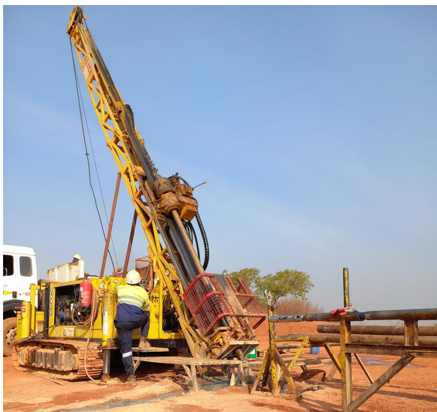
Figure 2: Target Drilling SARL diamond core drill rig