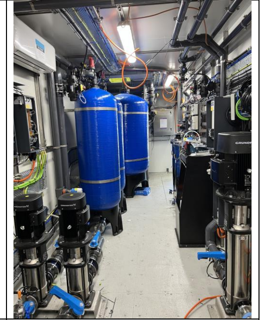
Image 2) De.mem Containerized Membrane Based Water Treatment Plant