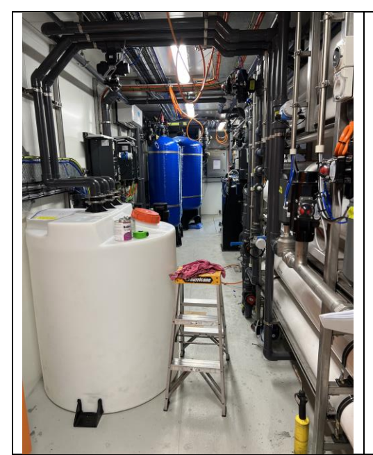
Image 1) De.mem Containerized Membrane Based Water Treatment Plant

As per the date of this report, the project is in the final stages of manufacturing with delivery planned for early December 2023. As of 30 September 2023, the vast majority of the cost under the contract, in particular for the purchase of components, had already been incurred; while most of the customer payments are scheduled for the December Quarter 2023 and March Quarter 2024.