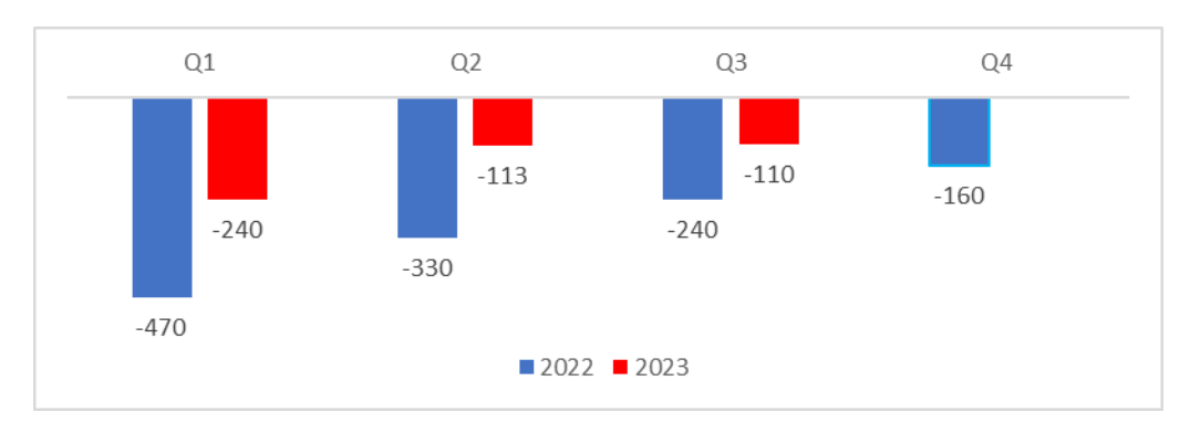
CHART 1: DECREASING QUARTERLY ADJ. EBITDA LOSS SINCE 2022 – ON TRACK TO ACHIEVING EBITDA BREAK-EVEN

The difference between EBITDA and operating cash flows is mainly in the revenue recognition for projects. While the revenues and margins for projects are already recognized in the Company's profit and loss statement, with a positive impact on EBITDA, customer payments are only reported as part of the operating cash flows when received on the bank accounts.