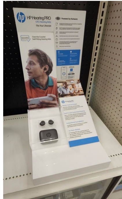
Figure 2: Hp Hearing PRO by Nuheara OTC Hearing Aid display in Target, Corpus Christi Texas USA.