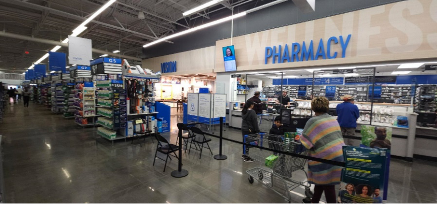
Figure 1: OTC Hearing Aid display in Walmart, New Jersey USA location, featuring HP Hearing PRO by Nuheara

Walmart's extensive network of stores, spanning the US and globally, positions it as a formidable player in the OTC hearing aid market. Walmart's strategic move underscores the changing dynamics of the healthcare market in the US, where accessibility and affordability have taken centre stage.