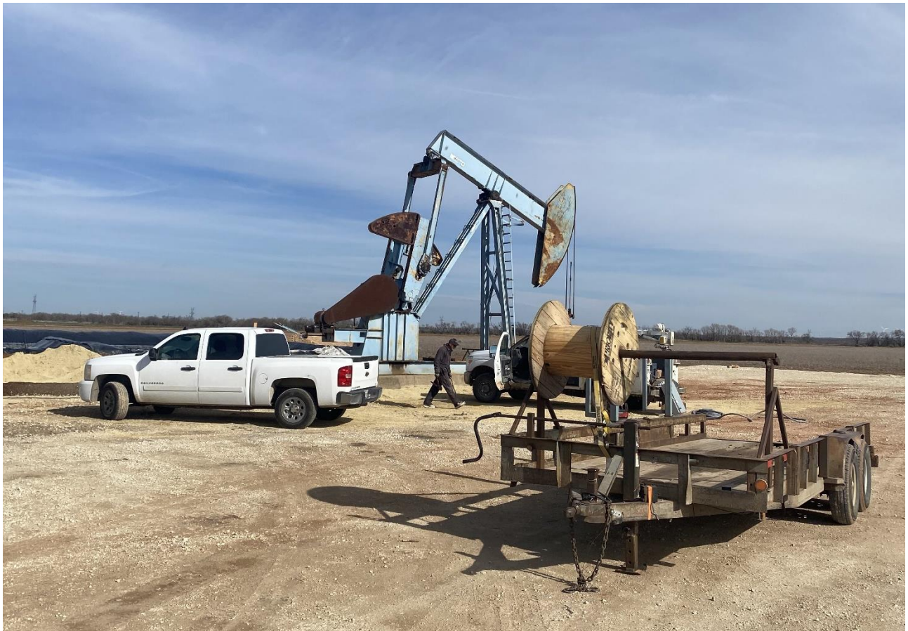
Figure 1: JVU #6 Pumping Unit