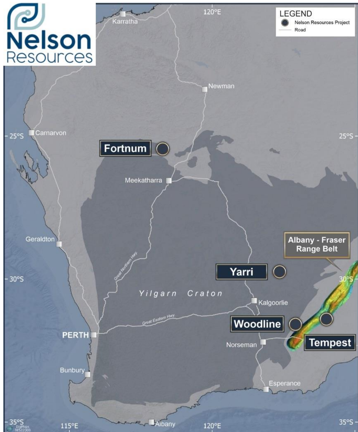
Figure 1: Project Locations.