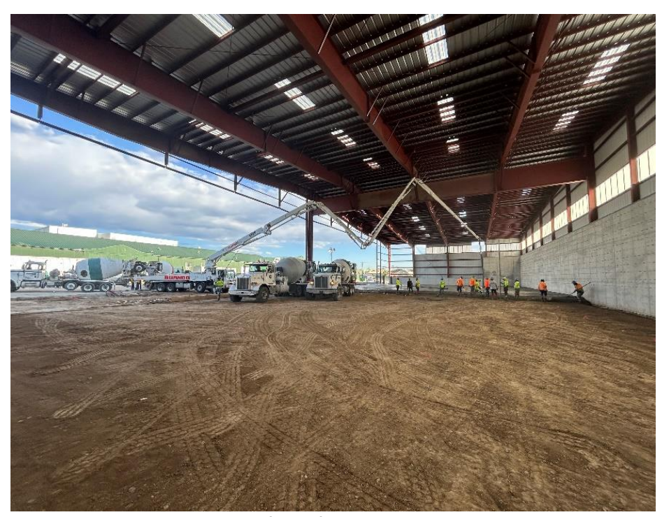
Figure 3. Construction of non-ferrous metal re-cycling station