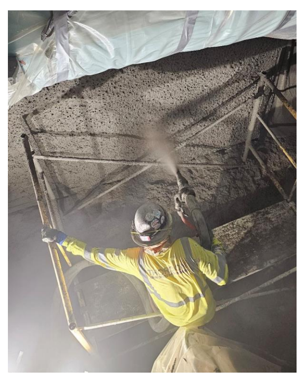
Figure 9. Shotcrete being sprayed onto wall with little dust and rebound.