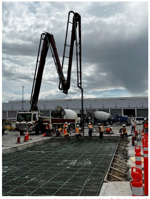
Figure 1. Concrete being replaced in full depth slab