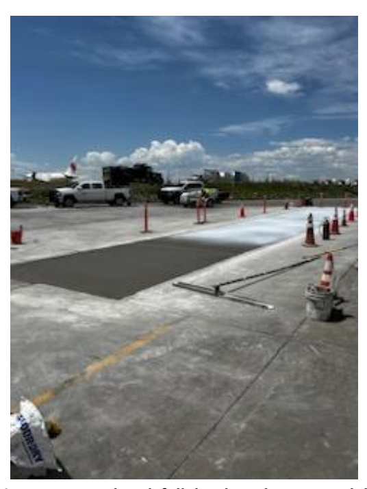
Figure 2. Completed full depth replacement slab