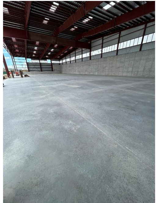
Figure 4. Completed concrete flooring