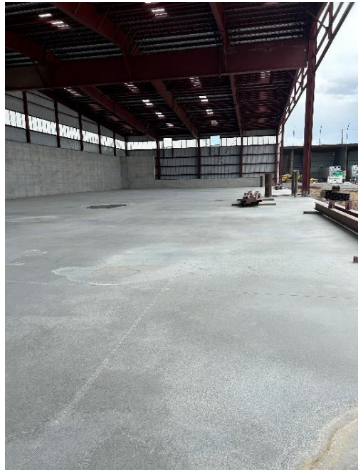
Figure 5. Completed concrete flooring