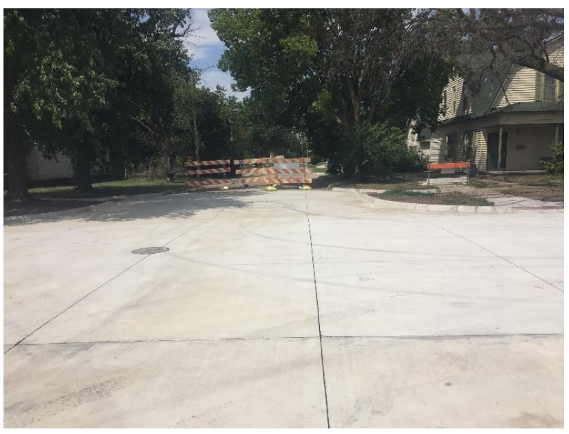
Figure 8. Completed roadway.