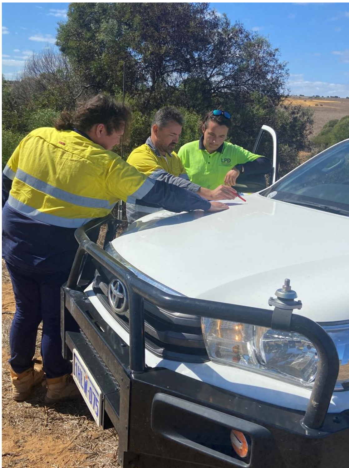
Figure 4: Port Gregory Project site visit working with surveyors to log drilling holes.

Further to the update last quarter regarding the Port Gregory project PFS has assessed proposals from credible mineral sands consultants to undertake a Pre-Feasibility Study (PFS) of the Port Gregory Project. This is the next study phase following the Port Gregory Scoping Study announced in September 2022. The PFS will commence in October 2023 and it is anticipated to take approximately 6 months to completed.