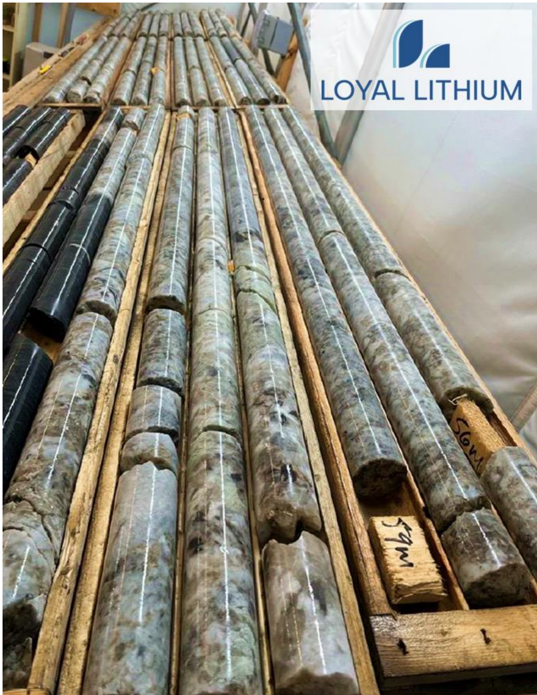
Image 1: Drill core from drill hole DIS23-014 showing significant spodumene mineralisation.

"The visual spodumene crystals within the core are large and abundant - in line with what we've seen at surface across the project. We will now have the core sent for assaying and commence planning for a more substantial drilling program in the winter."