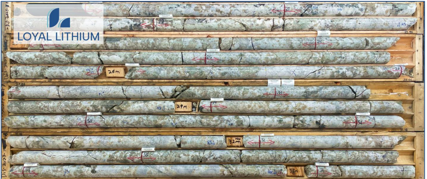
Image 2: Drill core from drillhole DIS23-001 showing significant spodumene mineralisation.

Loyal Lithium's maiden drilling program confirms Dyke #01 exhibits strong spodumene mineralisation (Image 3) and remains open in all directions. The large and abundant visually identified spodumene crystals highlight the fertility of the pegmatites at the Trieste Lithium Project. Core samples will now be selected and sent for assaying, with assay results expected by January 2024.