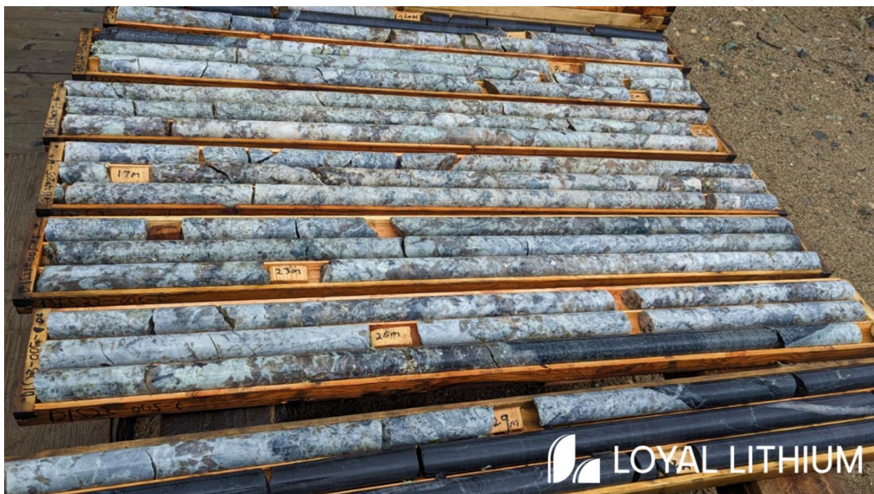
Image 4: Drill core from drill hole DIS23-005, prior to being logged, showing significant spodumene mineralisation.

The drilling program has been highly successful and commenced only 6 weeks after the completion of the summer field mapping program.