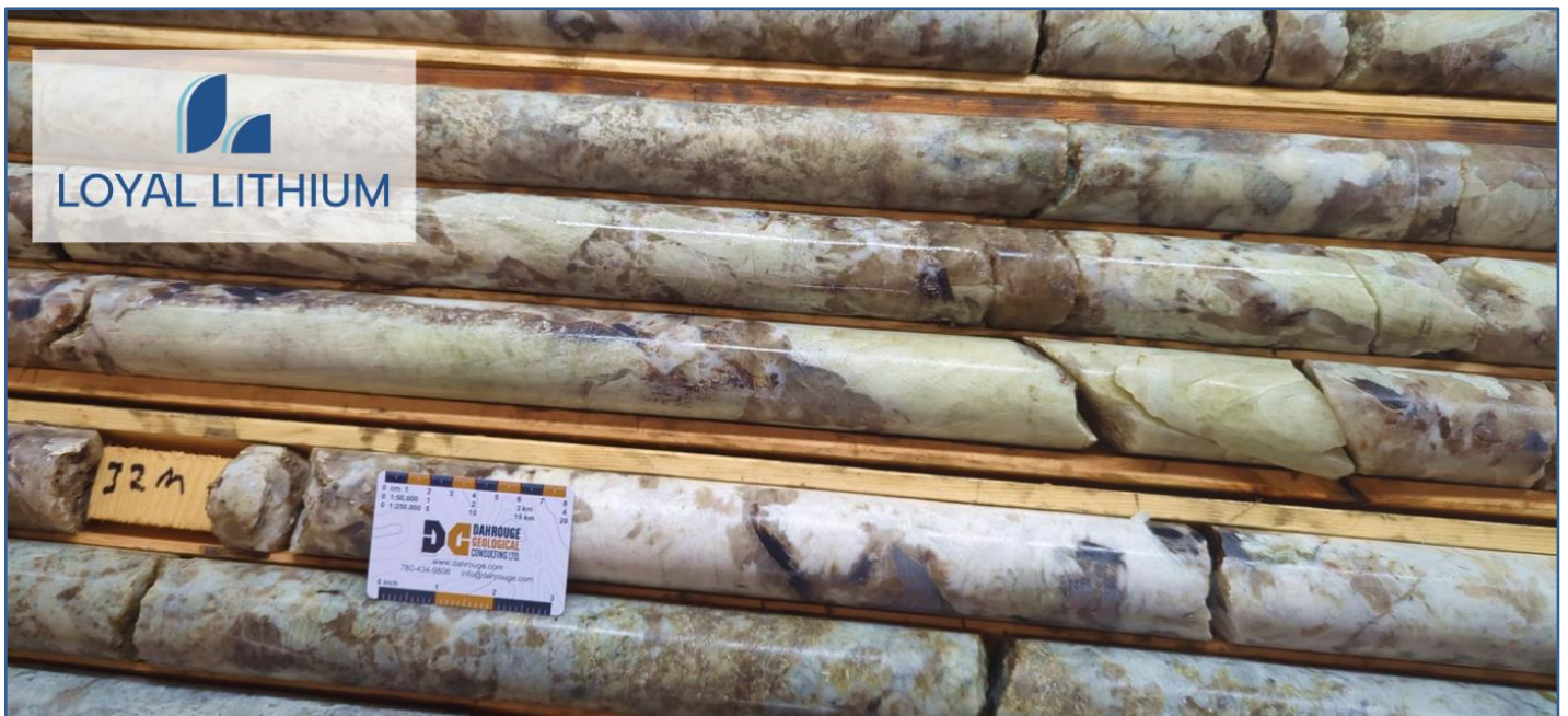
Image 3: Drill core from drill hole DIS23-004, prior to being logged, showing significant spodumene mineralisation.

Loyal Lithium's maiden drilling program confirms Dyke #01 exhibits strong spodumene mineralisation (Image 3) and remains open in all directions. The large and abundant visually identified spodumene crystals highlight the fertility of the pegmatites at the Trieste Lithium Project. Core samples will now be selected and sent for assaying, with assay results expected by January 2024.