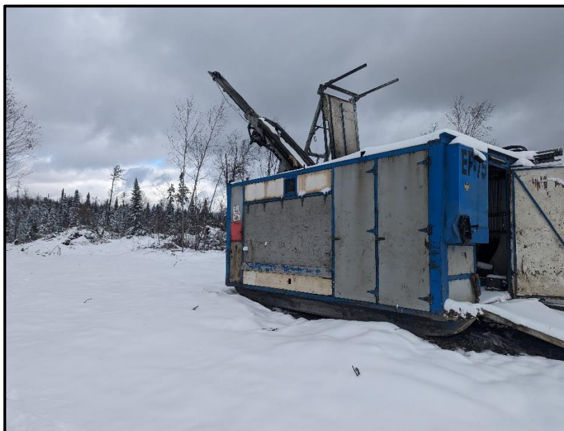
Figure 1 - Rodren Whitesand JV Drill Rig in position at Falcon Lake

Following a brief pause during the hunting season to respect the wishes of the Company's First Nations partners, Battery Age has remobilised personnel to Falcon Lake to recommence drilling. Drilling will primarily focus on the recently discovered step-out zone at Falcon East and target new pegmatite discoveries within other high-priority zones identified during the summer field work programme.