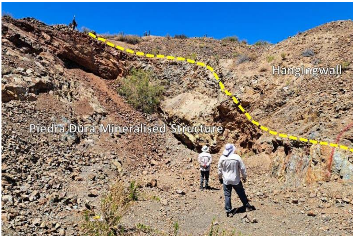
Figure 2: View looking south of the Piedra Dura Prospect mineralised zone.

The Piedra Dura Prospect is located 1.8km west of El Quillay within the Fortuna Project. The structurally controlled outcropping copper mineralisation has been delineated over 1.1km of strike and up to 100m width (Figure 2). Copper-oxide mineralisation at Piedra Dura has been historically exploited via both surface and underground mining. This represents the fourth key prospect that the Company has identified at the Project since its recent acquisition by Culpeo.