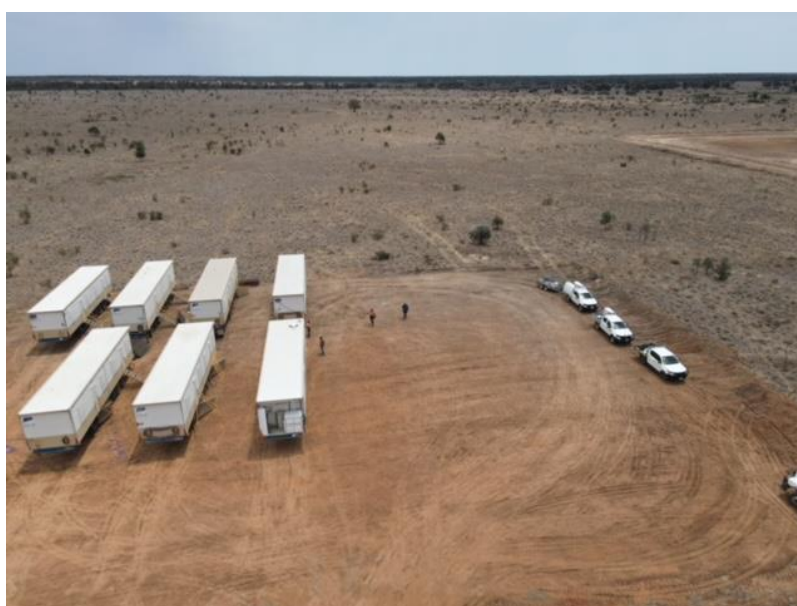
Equipment arriving at the Daydream-2 site

Elixir’s drilling contractor SLB (previously known as Schlumberger) has formally advised that the contracted rig SLR 185 has been released by its current operator. The drilling unit and camp are currently mobilizing to the Daydream-2 well site and following acceptance testing the well will be due to spud early next week.