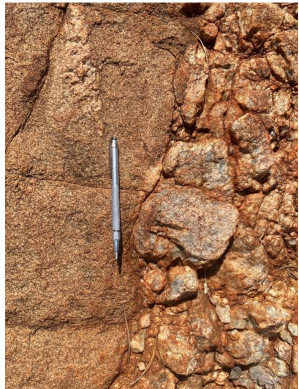
Figure 4: Photo the outcropping pegmatite.