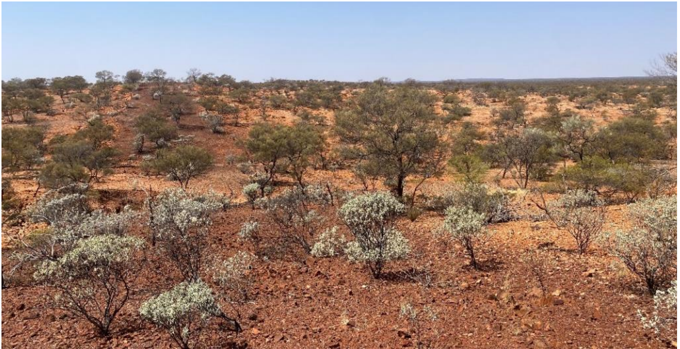
Figure 1: Photo showing the contact of the pegmatite intrusive with a basalt at the Mt Erong Prospect.