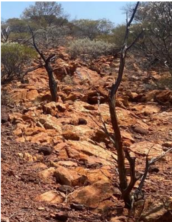
Figure 3: Photo showing one of the large pegmatites identified.