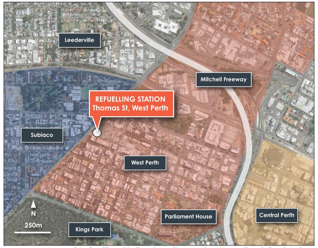
Image 1 – Map of Refuelling Station location and surrounding infrastructure

Development of this refuelling station is subject to final approvals, as well as a Final Investment Decision by Frontier.