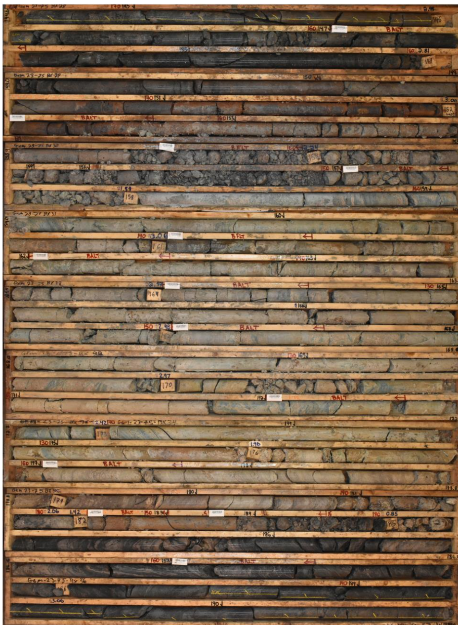
Figure 2: Strong brittle faulting with intense hydrothermal alteration in GEM23-075

Approximately 100m below, a second fault zone was intersected, characterized by strong fracturing and pervasive hematite alteration accompanied by 0.20% U_3O_8 (1,957ppm) over 1.5m. There has been limited drilling along the parallel structure, which has now been confirmed to extend over 600m. The 92 Energy team regards the parallel structure as a high-priority exploration target and is in the process of planning a follow-up drill program.