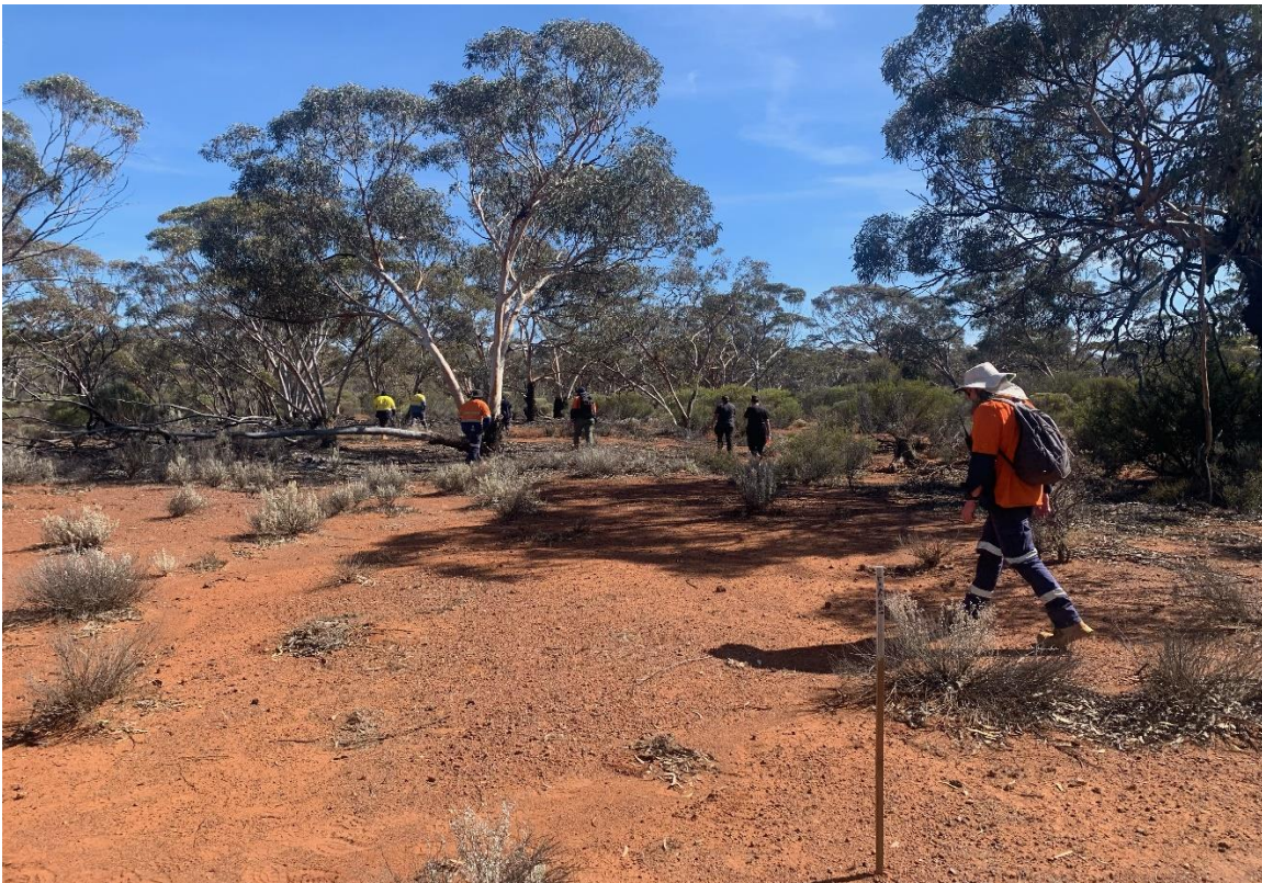
Figure 1: The Survey Team at Lepidolite Hill Project

Historical drilling has discovered thick and high-grade lithium bearing pegmatites at the Project (ref ASX: EFE 7 June 2023). Following completion of the Heritage Survey, the drill program will assess the further potential for lepidolite and petalite in the tenement, and test the potential for spodumene in lithium-bearing pegmatites. The Project is adjacent to FBM’s Kangaroo Hills Lithium project where thick spodumene bearing pegmatites were identified (ref ASX: FBM 12 September 2023).