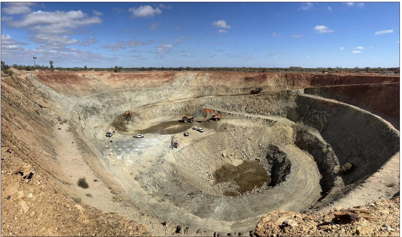
Figure 1 - Progress photograph (looking NW) of Selkirk Cutback, end October 2023

Over the coming months, ore will be stockpiled at the Selkirk ROM Pad and subsequently hauled to Genesis Minerals Limited's (ASX:GMD) Gwalia Processing facility in February 2024 for processing in a single parcel during currently elevated AUD gold prices of +$3,050/oz which is above the budgeted conservative gold price of $2,850/oz.