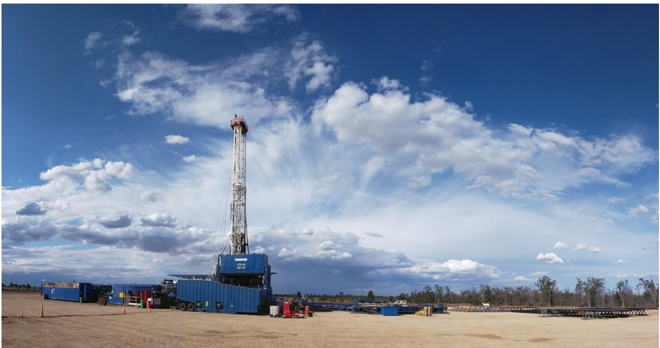
SLR 185 Rig

Elixir Energy Limited (“Elixir” or the “Company”) is pleased to provide an update on the its 100% owned Grandis Gas Project (ATP 2044) located in the Taroom Trough of the Bowen Basin, Queensland.