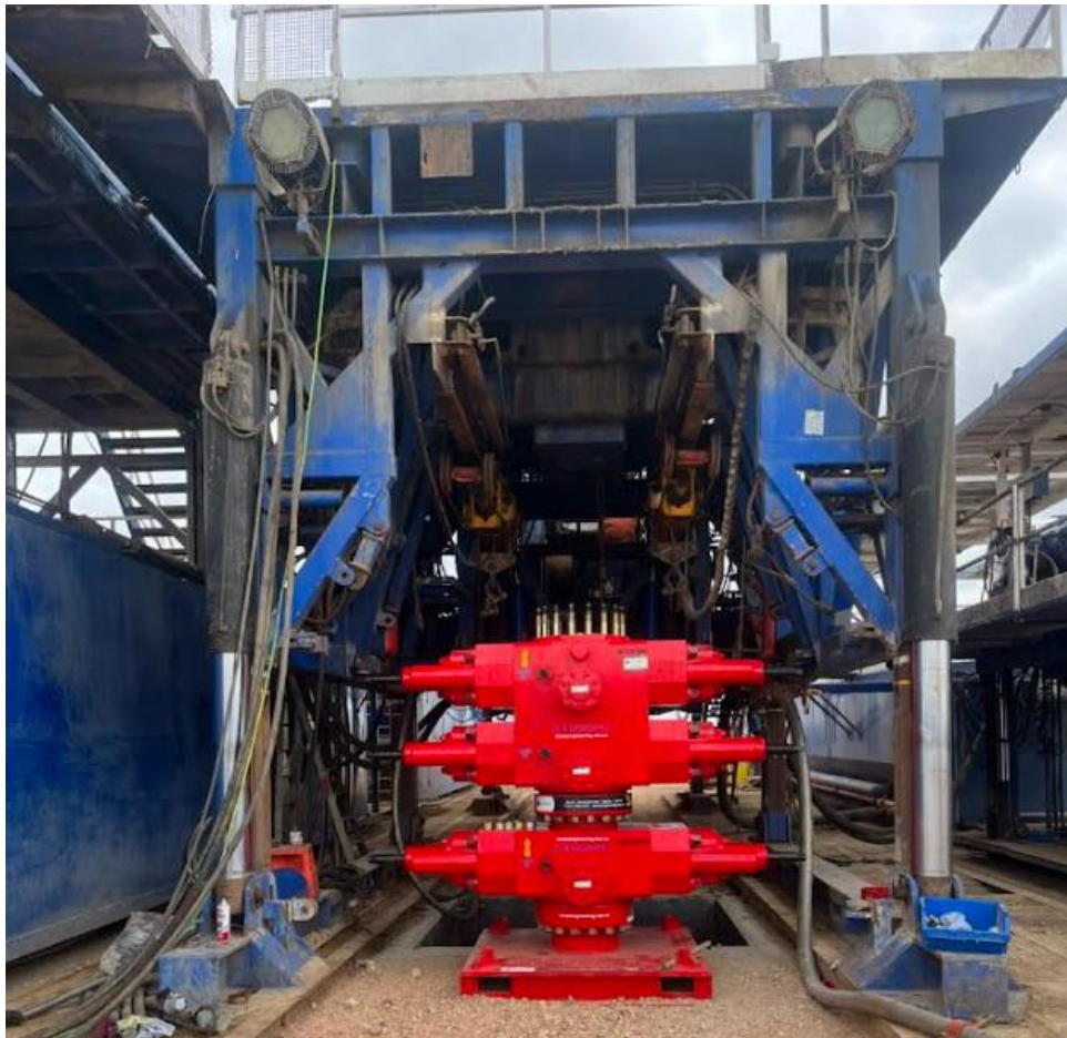
BOP and Sub-base of SLR 185 Rig

SLB's (previously called Schlumberger) SLR 185 rig and a new 10,000 psi blow-out preventer (BOP) were duly accepted/certified prior to the spud.