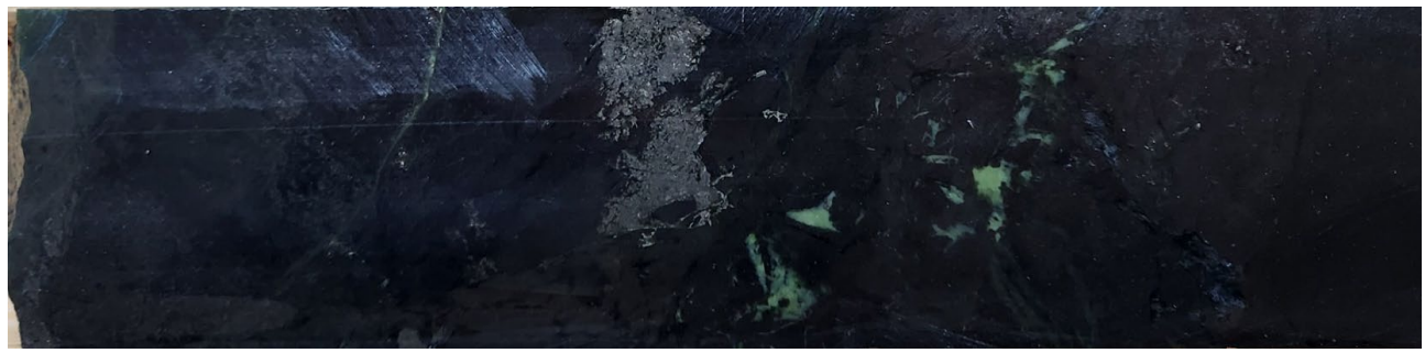
Figure 1: DDED23-143 nickel sulphides (pentlandite-pyrrhotite) in altered peridotite

Aston Minerals Limited ( ASX: ASO , ' Aston Minerals ' or 'the Company ') is pleased to announce the success of the shallow infill drilling program at Bardwell, with all 10 holes intersecting near surface nickel mineralisation along a 1km strike length.