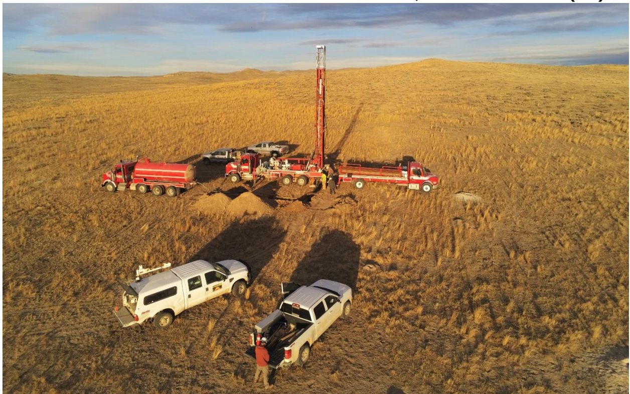
FIGURE 1. MUD ROTARY DRILLING AT GTI'S LO HERMA PROJERCT, POWDER RIVER BASIN (WY)

GTI Energy Ltd ( GTI or Company ) advises that drilling has now commenced at its 100% owned Lo Herma ISR Uranium Project ( Lo Herma ) located in Wyoming's prolific Powder River Basin ( Figures 1 & 2 ). The drill program is utilising mud rotary drilling & down hole gamma logging.