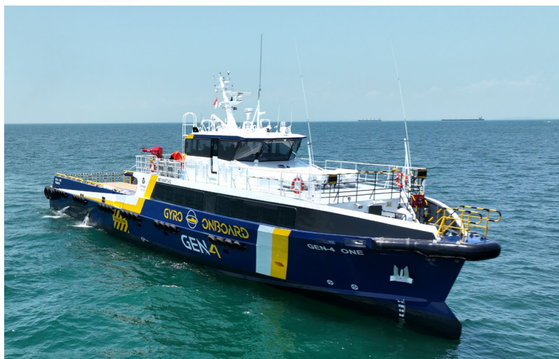
Strategic Marine's Gen 4 fast crew boat

VEEM and Strategic Marine have been working together for several years on the incorporation of the VEEM gyro into their latest fourth-generation fast crew boat (FCB). Strategic Marine launched the new vessel to the offshore energy industry, with the VEEM gyro as a key feature, in Singapore in March 2023. Strategic Marine is marketing the gyro as a unique selling point for their product which delivers superior economics and vessel capabilities for operators.