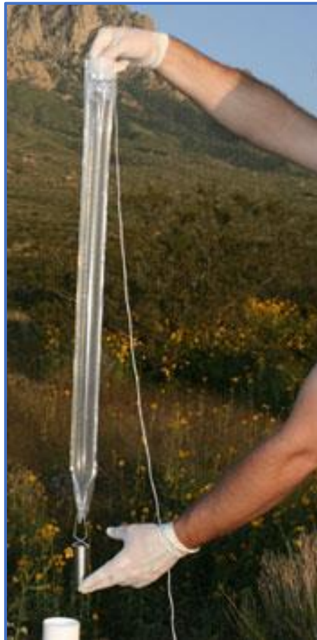
Figure 2: Photo of HydraSleeve

All holes will be terminated once in contact with the basalt bedrock.