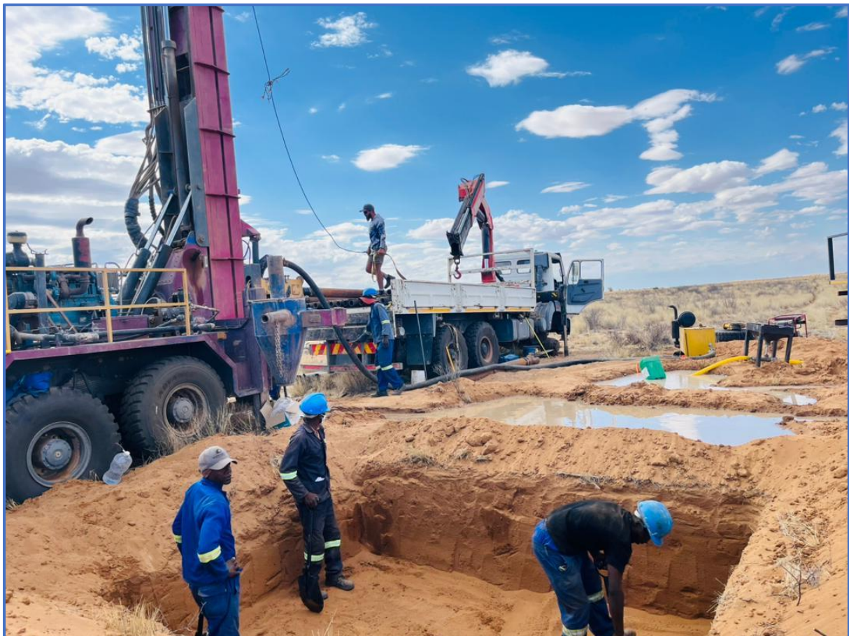
Figure 3: Photo of drilling operations underway