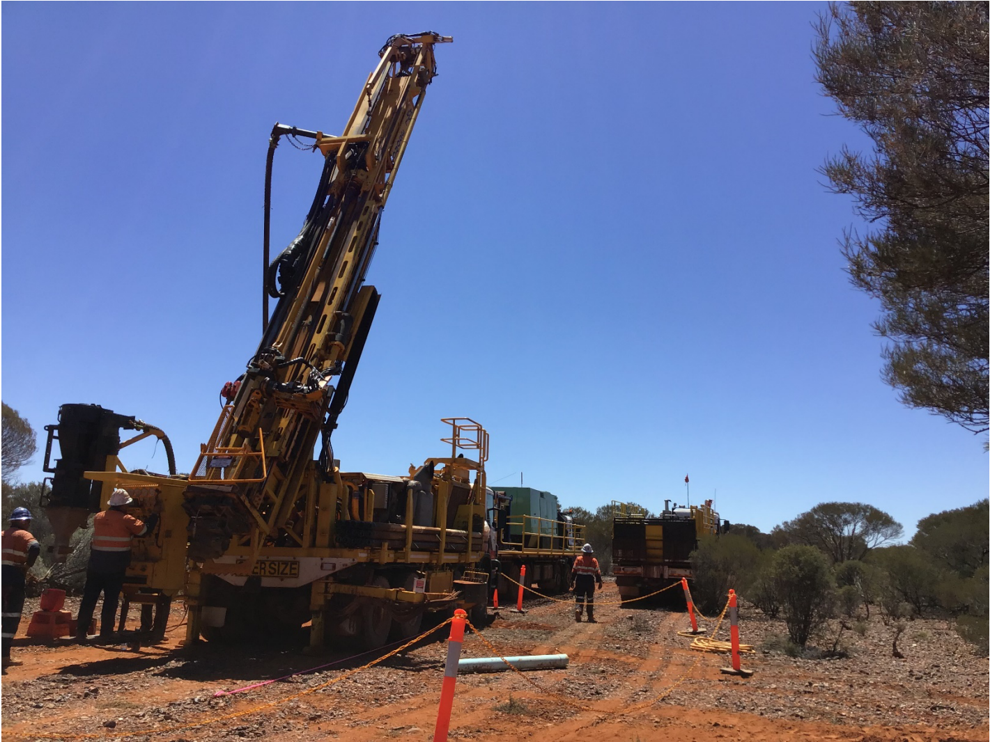
Figure 1: Drilling underway at Mt Lucky