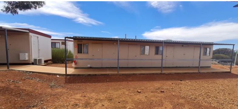
Figure 1 - Camp Infrastructure

• six 6m x 6m reconditioned carbon-in-leach ( CIL ) adsorption tanks for total cash consideration (including delivery to the Laverton mill) of $110,000, which have an estimated replacement value of $1,000,000.