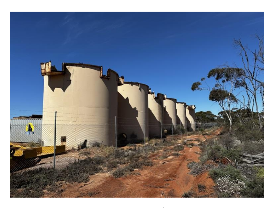
Figure 2 - CIL Tanks

The CIL tanks, which can supplement the existing infrastructure, can also be used to potentially expand the throughput of the processing facility above the 0.5Mtpa assessed in the Scoping Study. Additional details of the Camp Acquisition are set out in Annexure A.