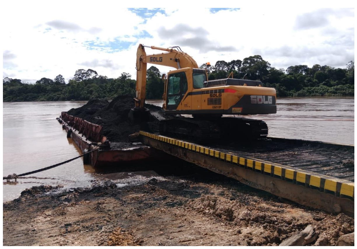
BBM coal being transported via barge