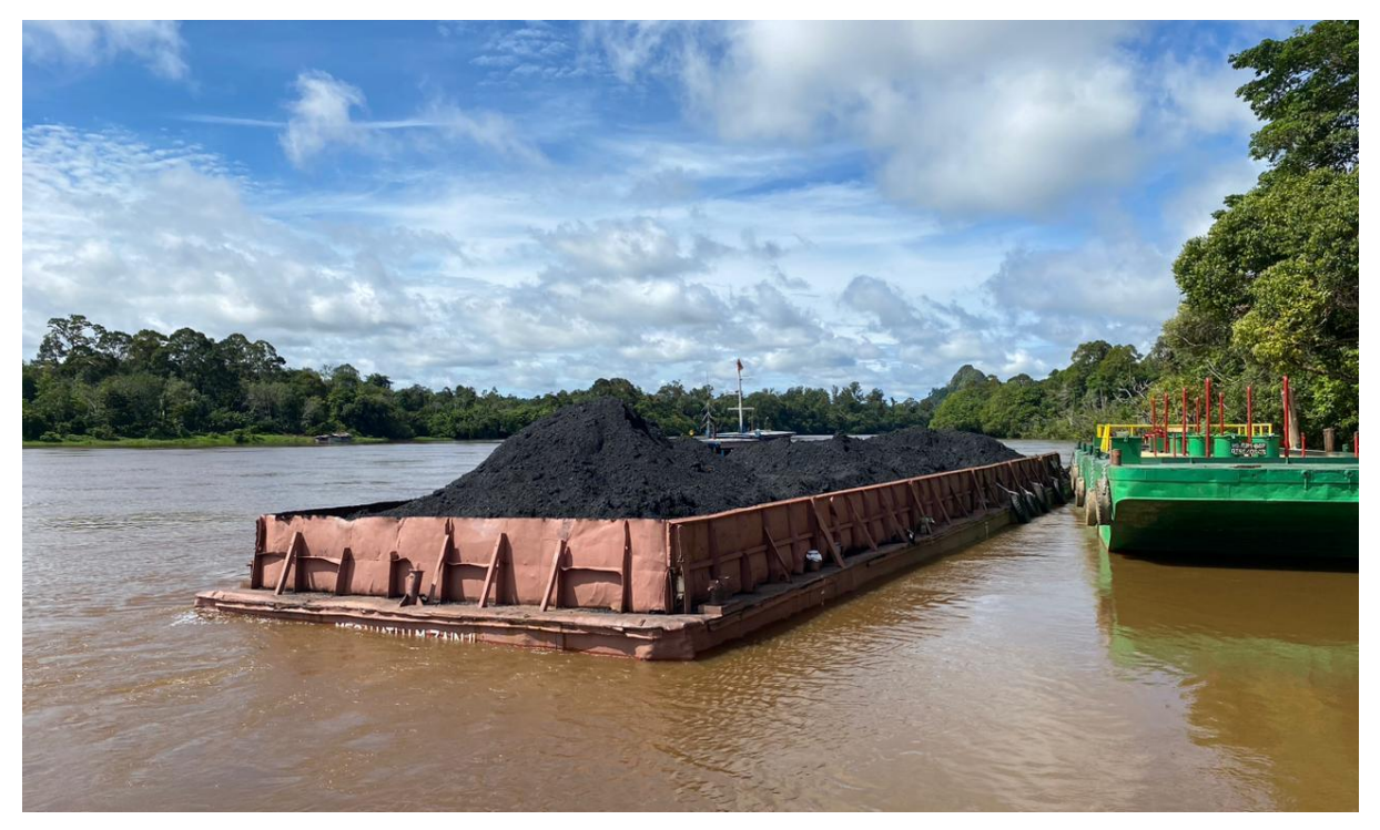
BBM coal being transported via barge