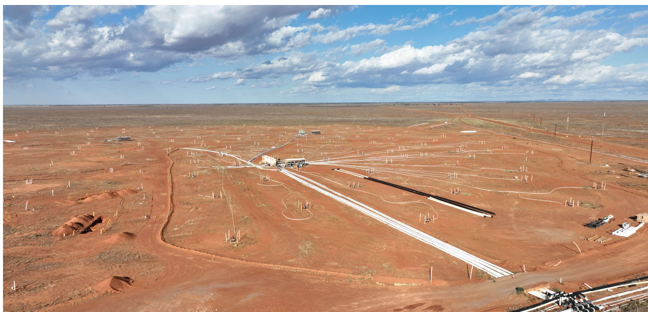
Figure 1: Pre-flushing of the Start-up Wellfields

The supporting infrastructure is operating to design specifications, including the raw water system, the 25,000 ton gypsum repository, reagent handling systems and first fills of key reagents.