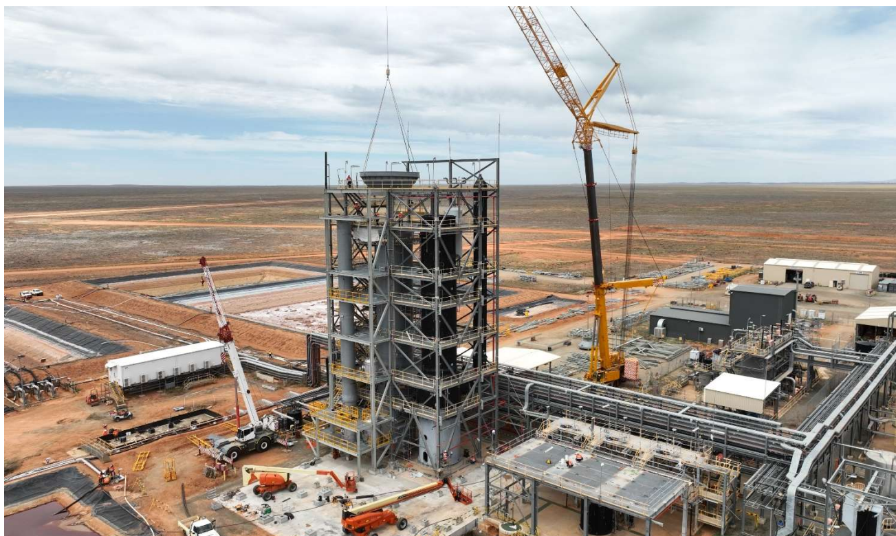
Figure 2: Installation of last section of the absorption Column 1 & steelworks