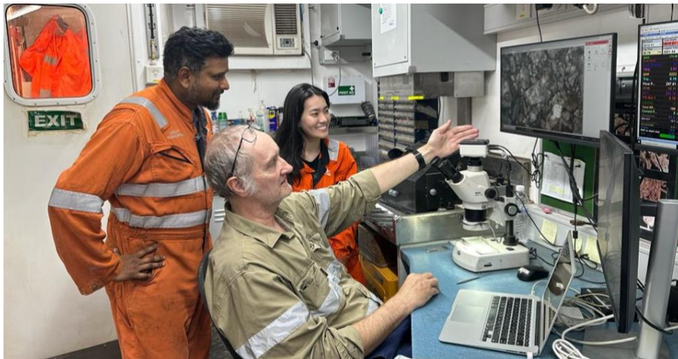
Engineers & geologists in Daydream-2's Mudlogging Unit

The well will now drill the remaining reservoir section to a Total Depth (TD) of approximately 4,200 metres, then wireline logs will be run and a petrophysical evaluation undertaken. The well will be then cased and suspended for future stimulation and testing operations, planned for the New Year.