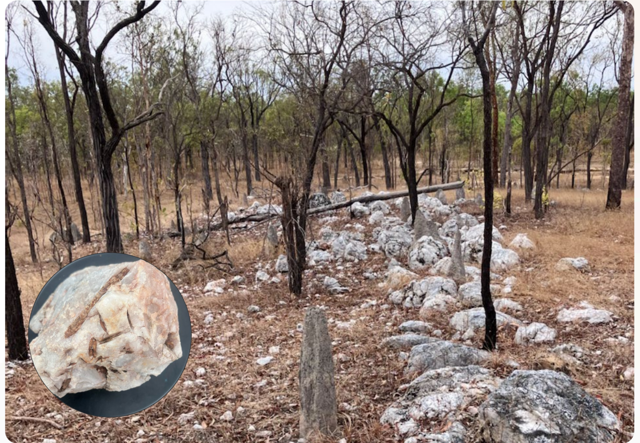
Above: Site image from recent New Goldfield Extended site visit. Inset: Image of sample recovered from New Goldfield Extended site visit at or near surface.