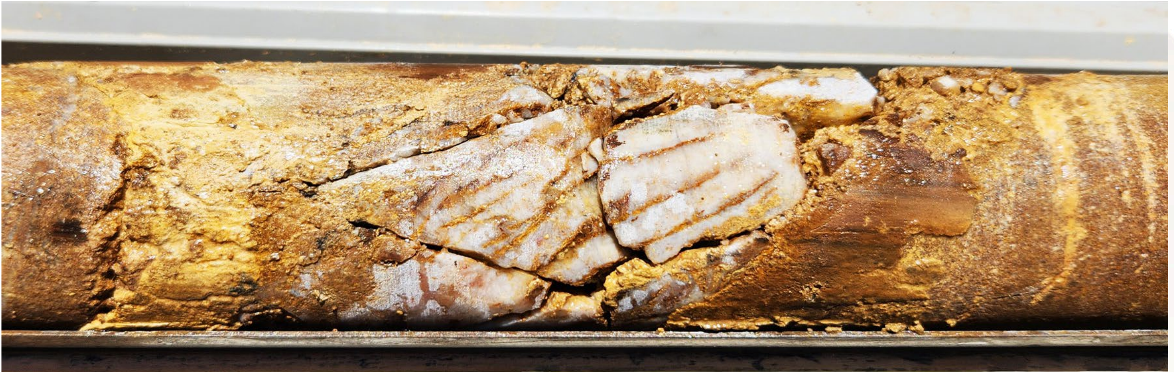
Yellow Jack – Drilling commenced within weeks of IPO

Core sample from diamond drill hole 23YJDD217 between 17.70 and 17.89 m showing iron-rich quartz veining.