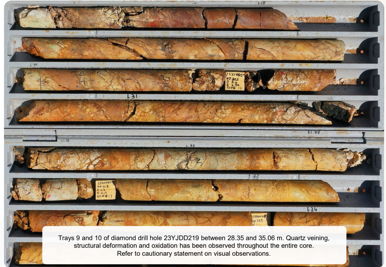
Trays 9 and 10 of diamond drill hole 23YJDD219 between 28.35 and 35.06 m. Quartz veining, structural deformation and oxidation has been observed throughout the entire core. Refer to cautionary statement on visual observations.