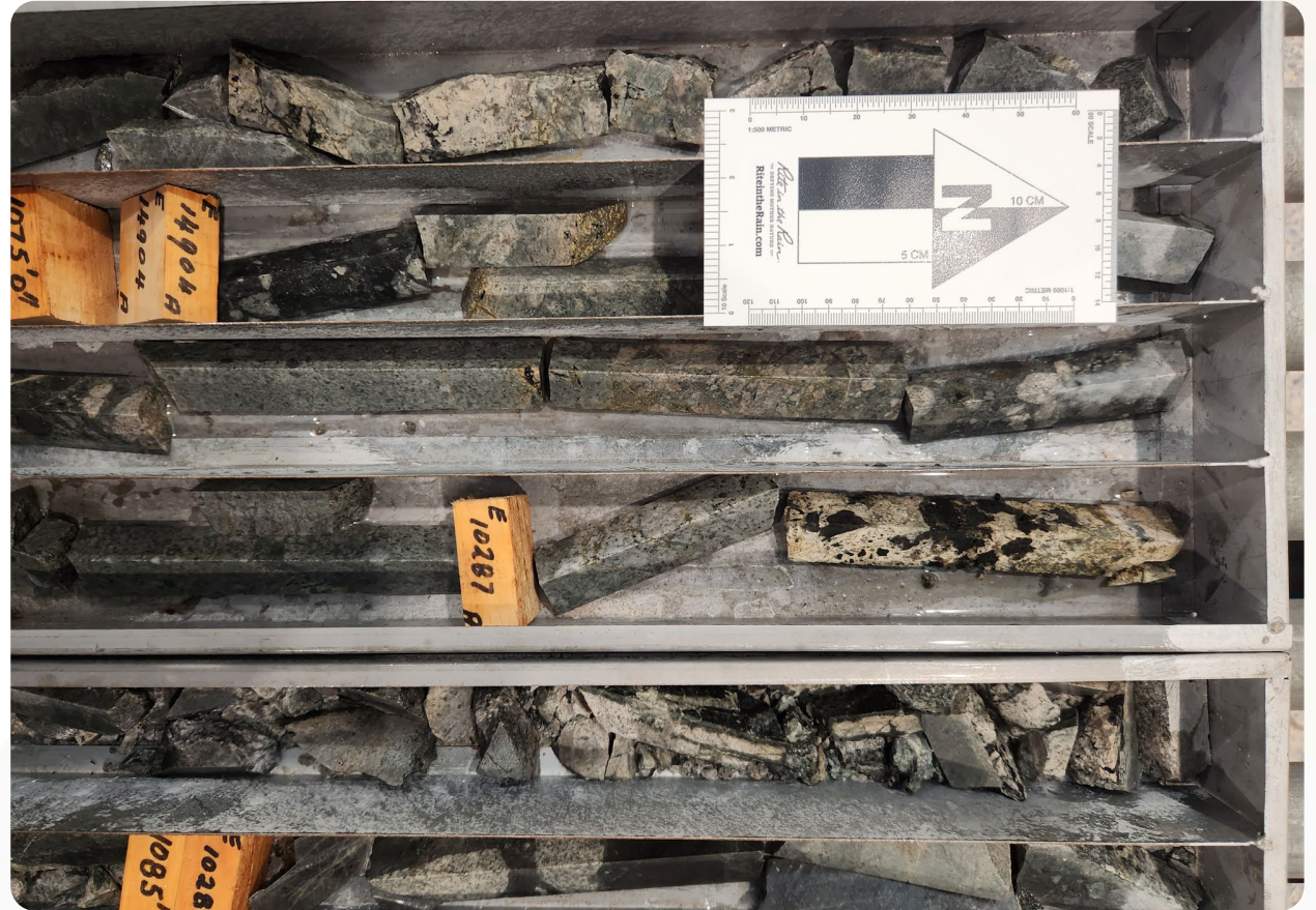
Above: Core samples retrieved from historical drilling at Gibraltar Rock for further analysis by the GDM geological team