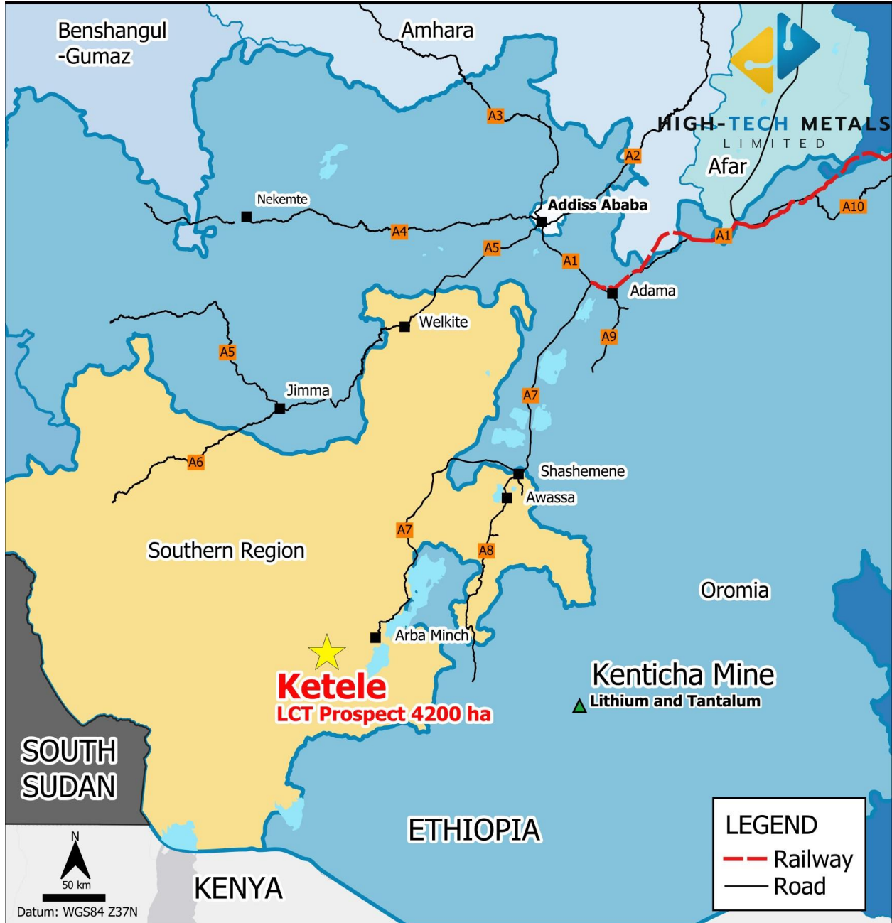
Figure 1 – Ketele LCT Project Location.