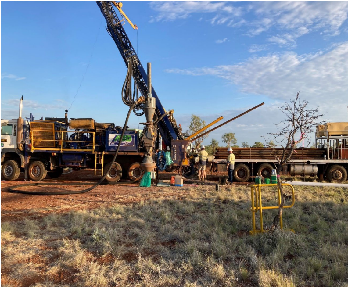
Photo1: Drill rig on-site at the Clarries prospect, Mayfield

C29 Metals Limited ( C29 , or Company ) is pleased to advise that drilling has commenced at its 100% held Mayfield Copper-Gold project.