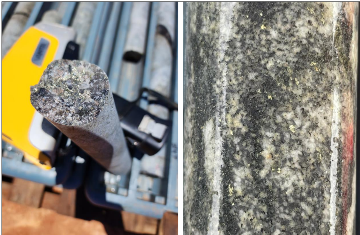
Figure 3: Visible sulphides within relative fresh granite. Small golden blebs are chalcopyrite and silver-yellow sulphides are pyrite. These occur intermittently between 405 and 410m.

In the area between 395 and 410m, disseminated pyrite and specs of chalcopyrite ( Figure 3 ) are observed and, critically, these do not occur as infills in joints or as post intrusive veining, but “insitu” or disseminated within the granite itself. This observation is encouraging as it suggests that the ‘deposition” of these sulphides occurred as part of the crystallisation of the granites and is therefore directly associated with the intrusions, most likely with deposition from hydrothermal fluids associated with the magma intrusion.