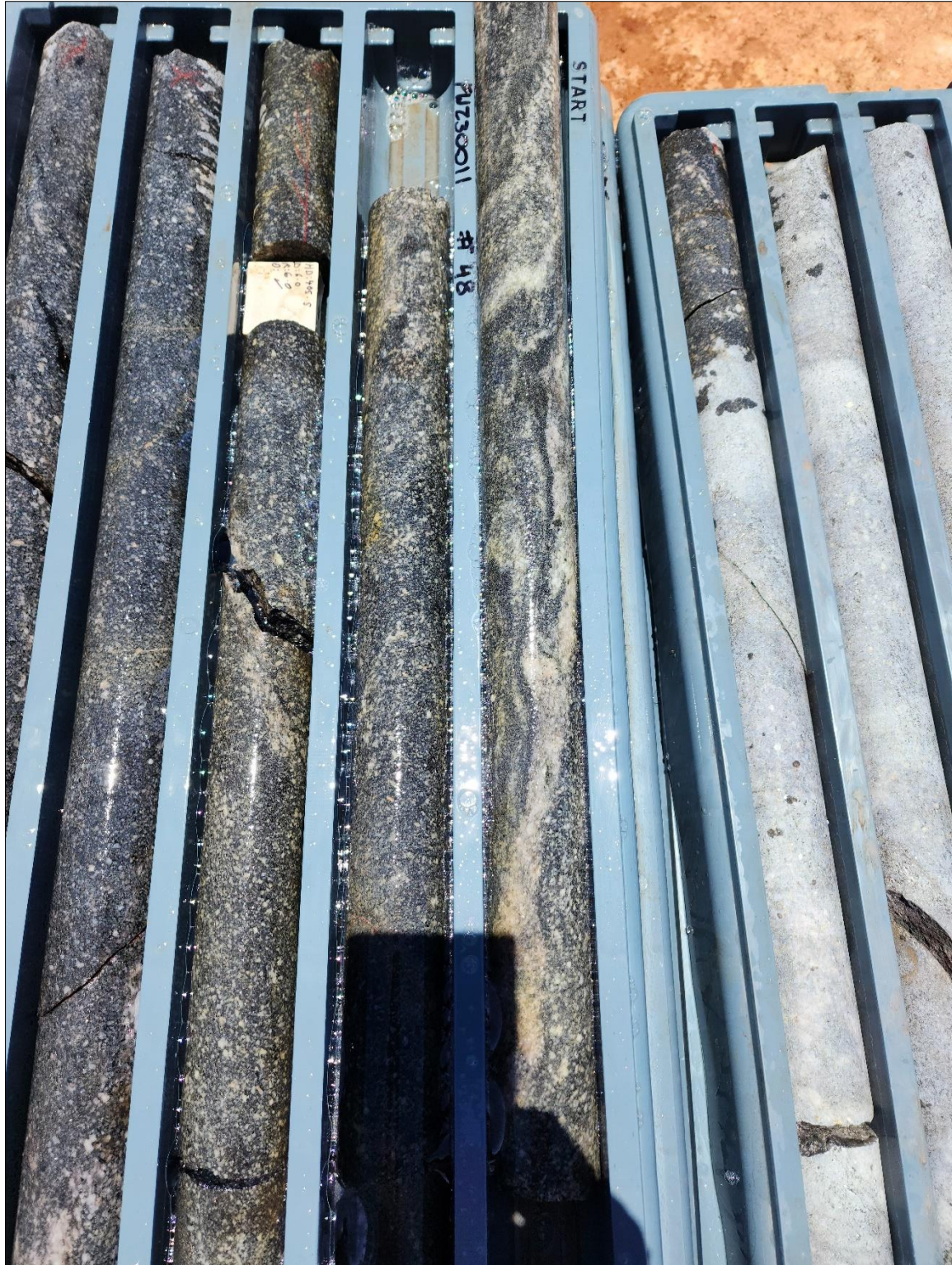
Figure 2: Strongly altered granite with clear deformational structures at 405m

ASX Announcement | 05 December 2023 | ASX: ICG