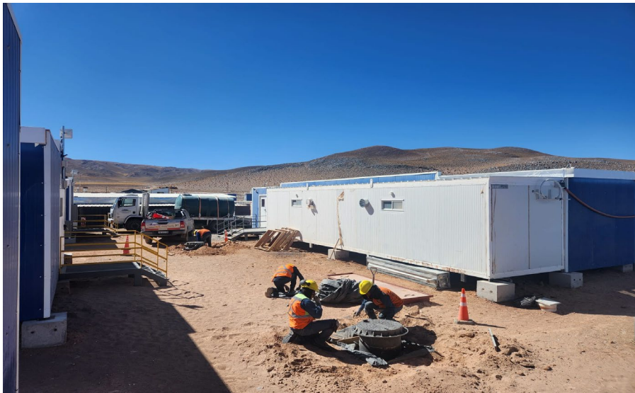
Figure 4: Camp infrastructure and services being installed