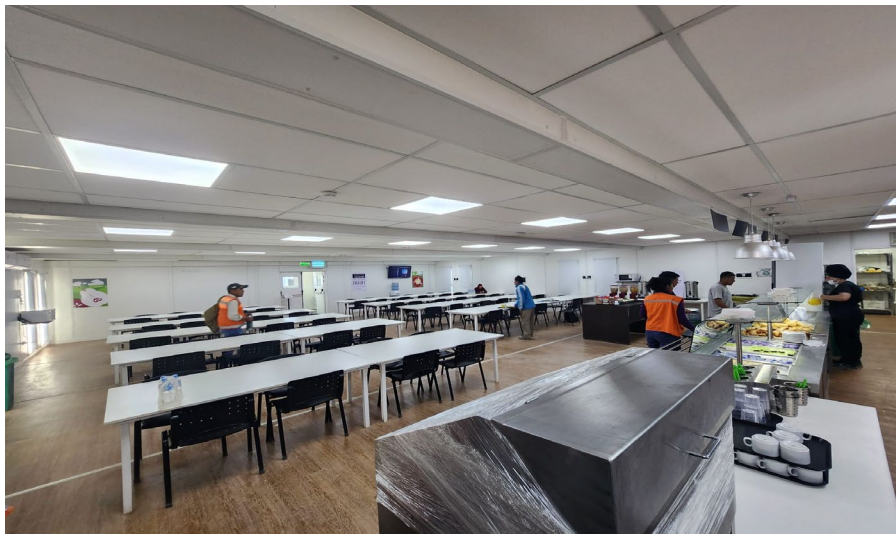
Figure 5: New camp mess nearing completion