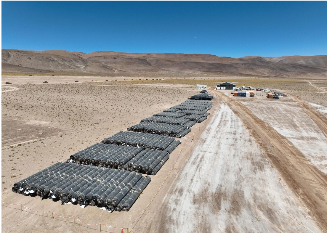
Figure 6: Liners on site ready for installation

The Galan Board has authorised this release.