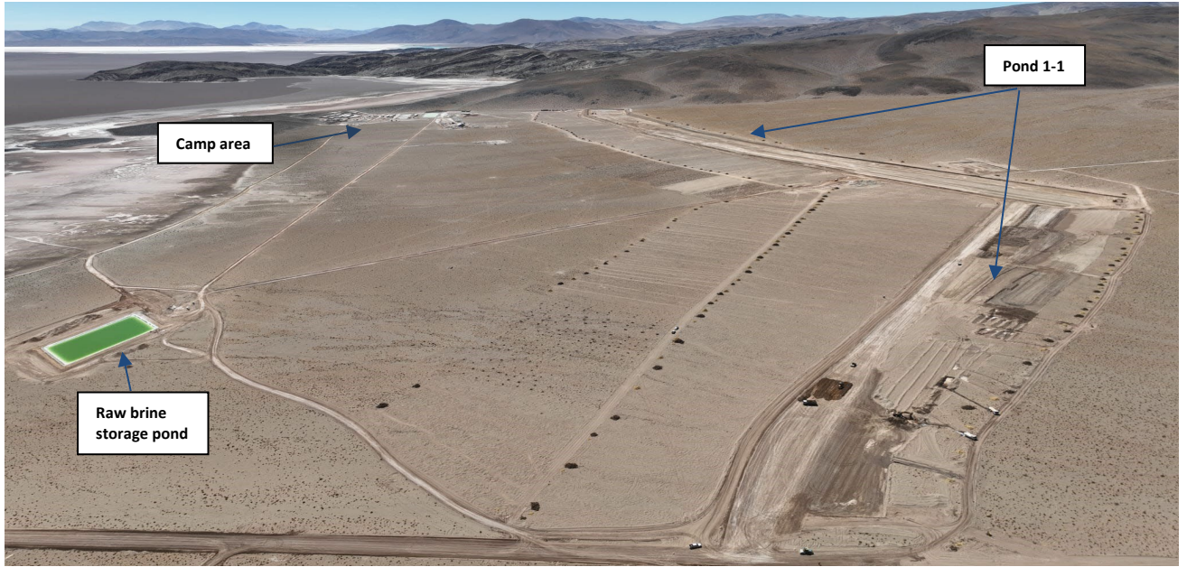
Figure 1: Pond 1 construction progress and Ponds 2 & 3 preparation works underway