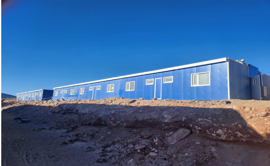
Figure 3: Camp modules installed