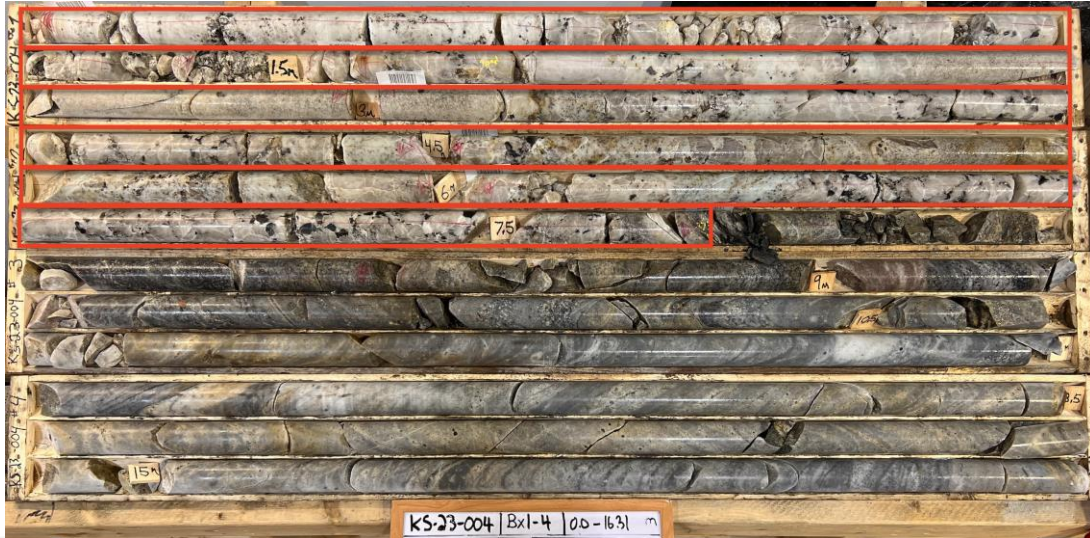
Figure 2 – Core boxes containing spodumene mineralisation in hole KS-23-004

Balkan notes that the most recently completed hole at Koshman – KS-23-009 – has encountered ~16.8m of visual spodumene mineralisation from 5.8m to 22.7m.